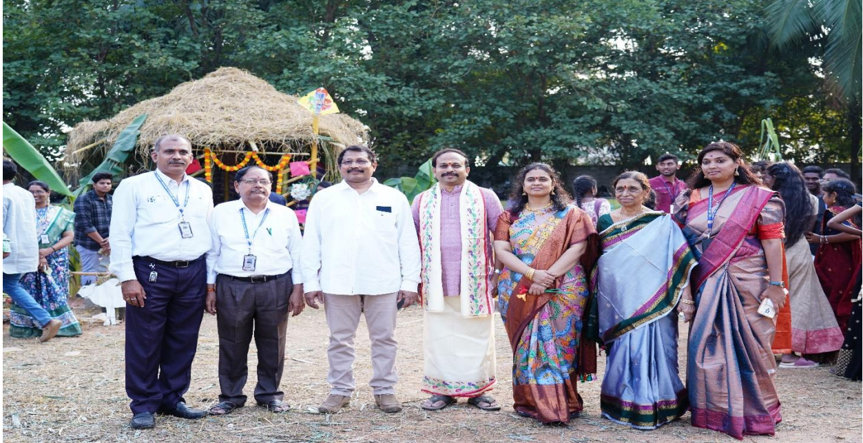
Chairman sir visit to Traditional house prototypes