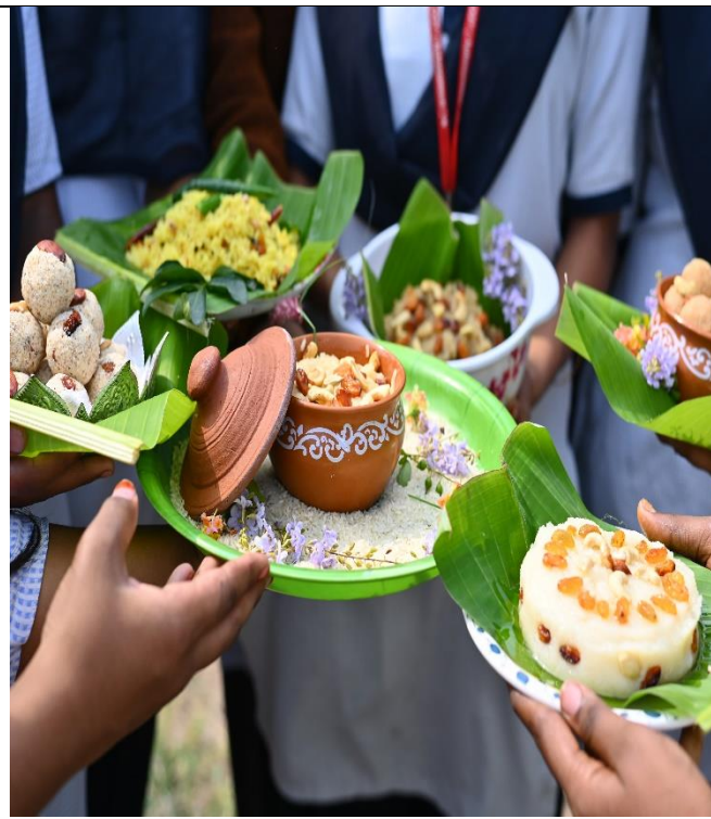
Students cooking Traditional Food