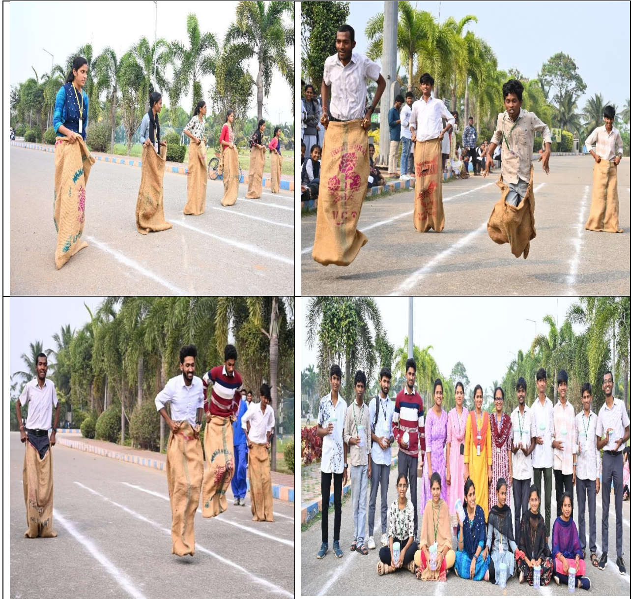
Students Participated in the Sag Race Competition

Participants engaged in friendly competition, showcasing their agility in the traditional sag race, adding an element of fun and excitement.