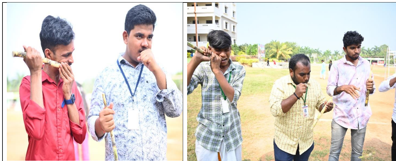
Students Participating in Sugarcane Eating Competition

A sweet challenge that brought out participants' gusto as they indulged in the deliciousness of sugar cane, adding a traditional flavor to the festivities.