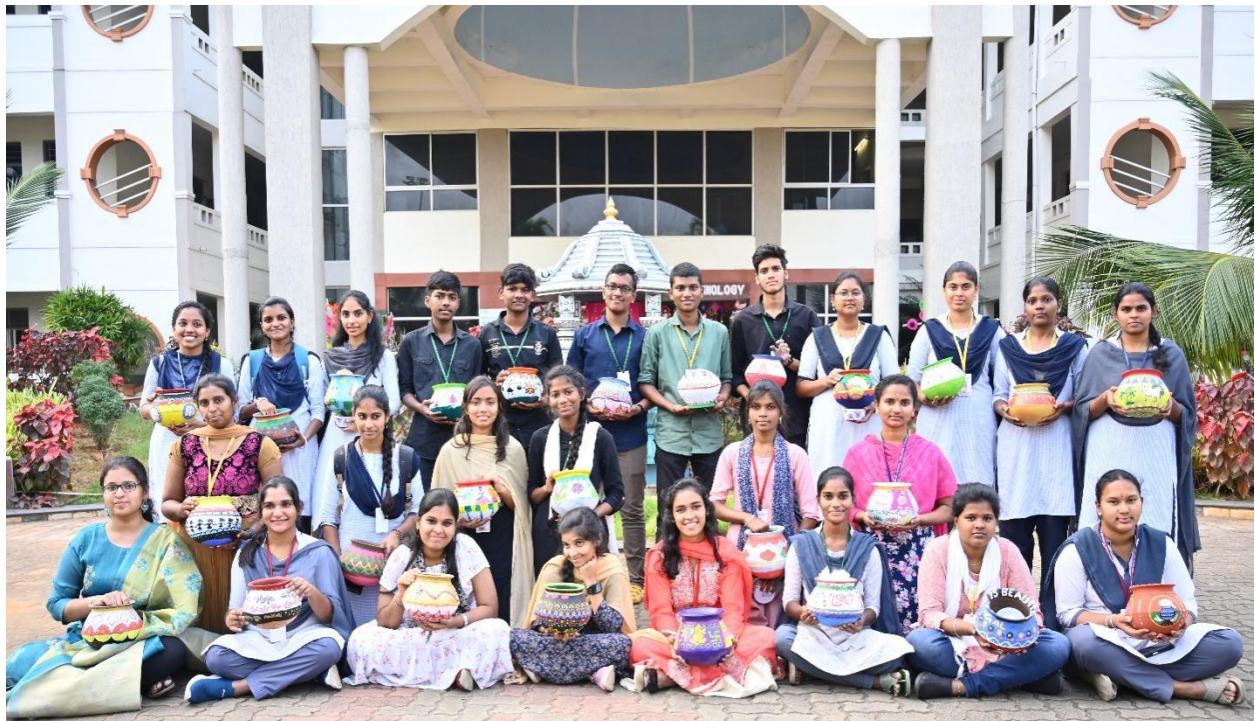
Students Participated in the Pot Painting Competition