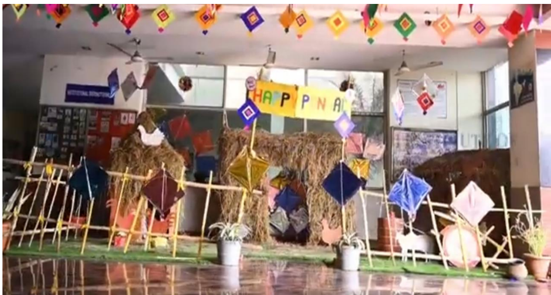
Decoration at Lobby

On the second day the college set for celebrations. The Lobby is decorated with the theme of Sankranti.