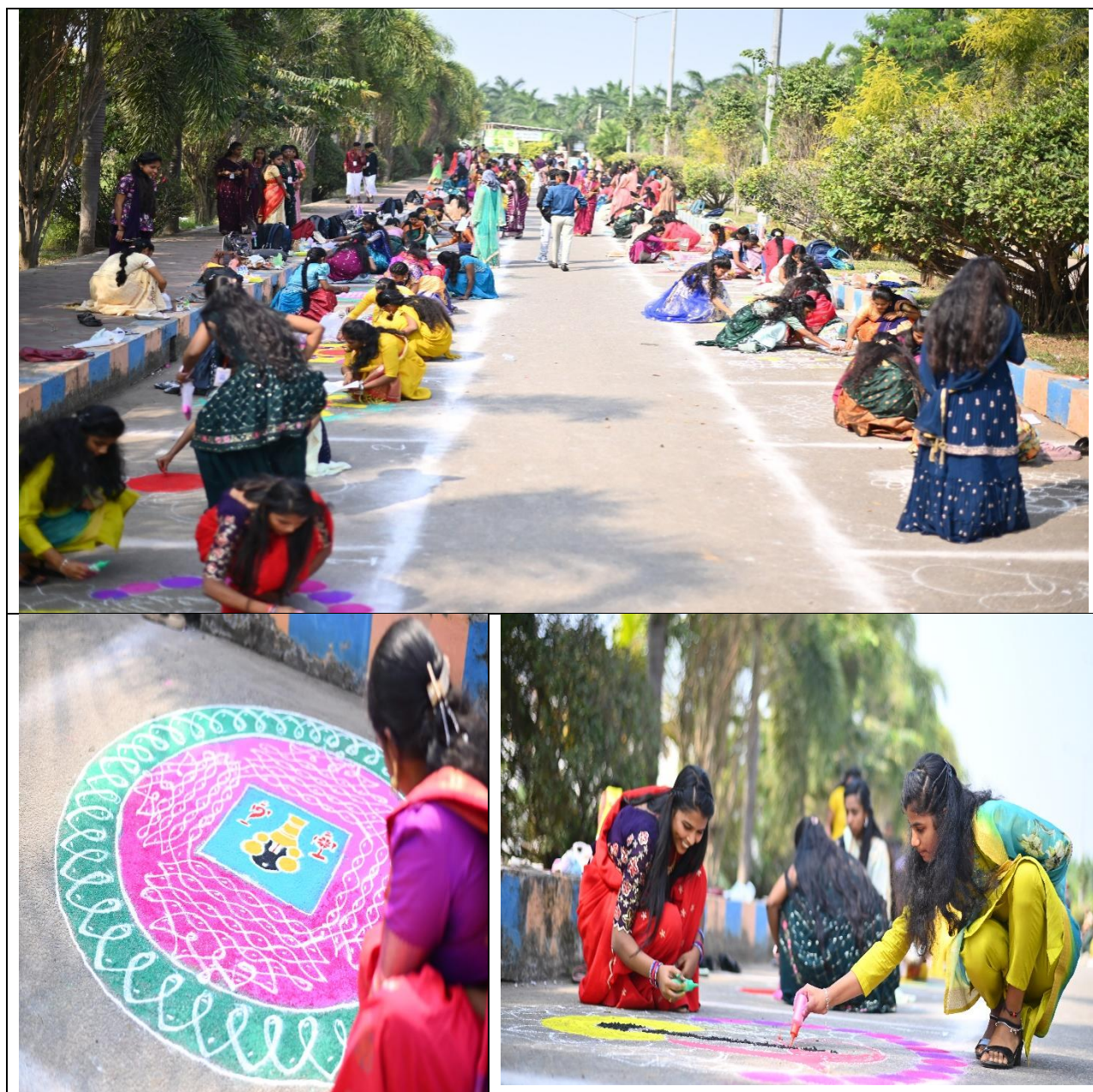
Students Participating in Rangoli Competition

The Rangoli competition allowed students to showcase their creativity by designing intricate and colorful patterns, transforming the college grounds into an artistic canvas.