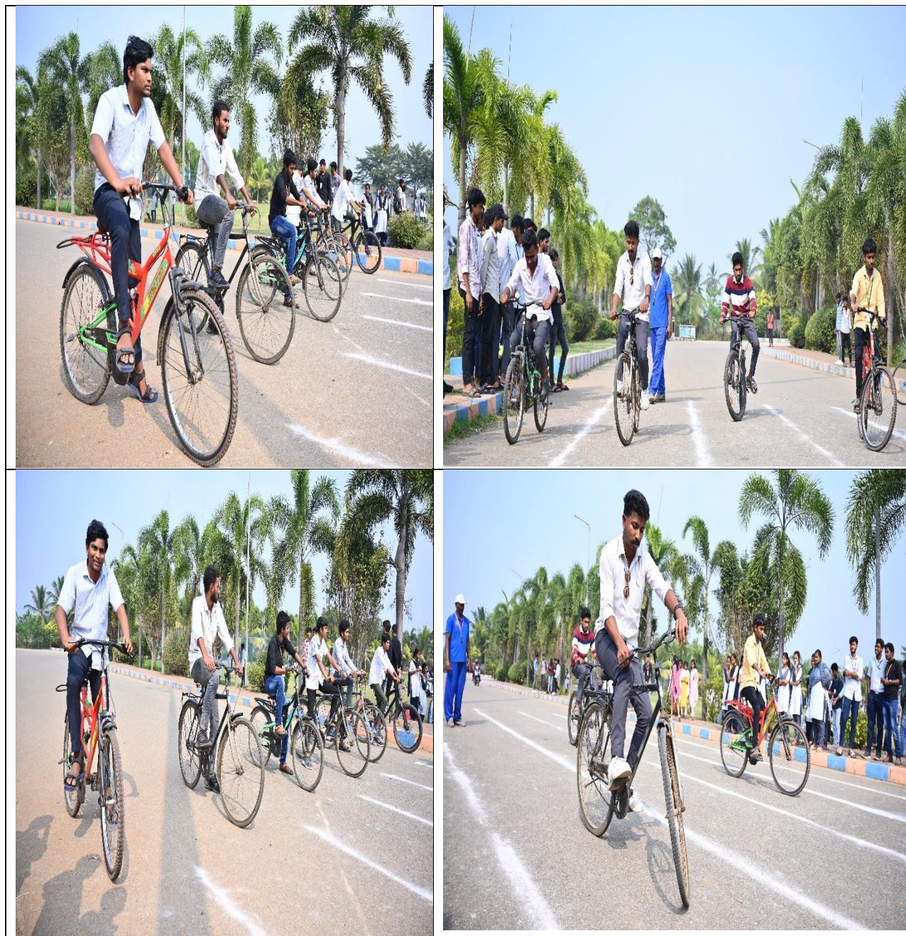
Students Participated in the Slow cycling

The slow cycling race tested participants balance and control, providing a unique and entertaining activity for both participants and viewers.