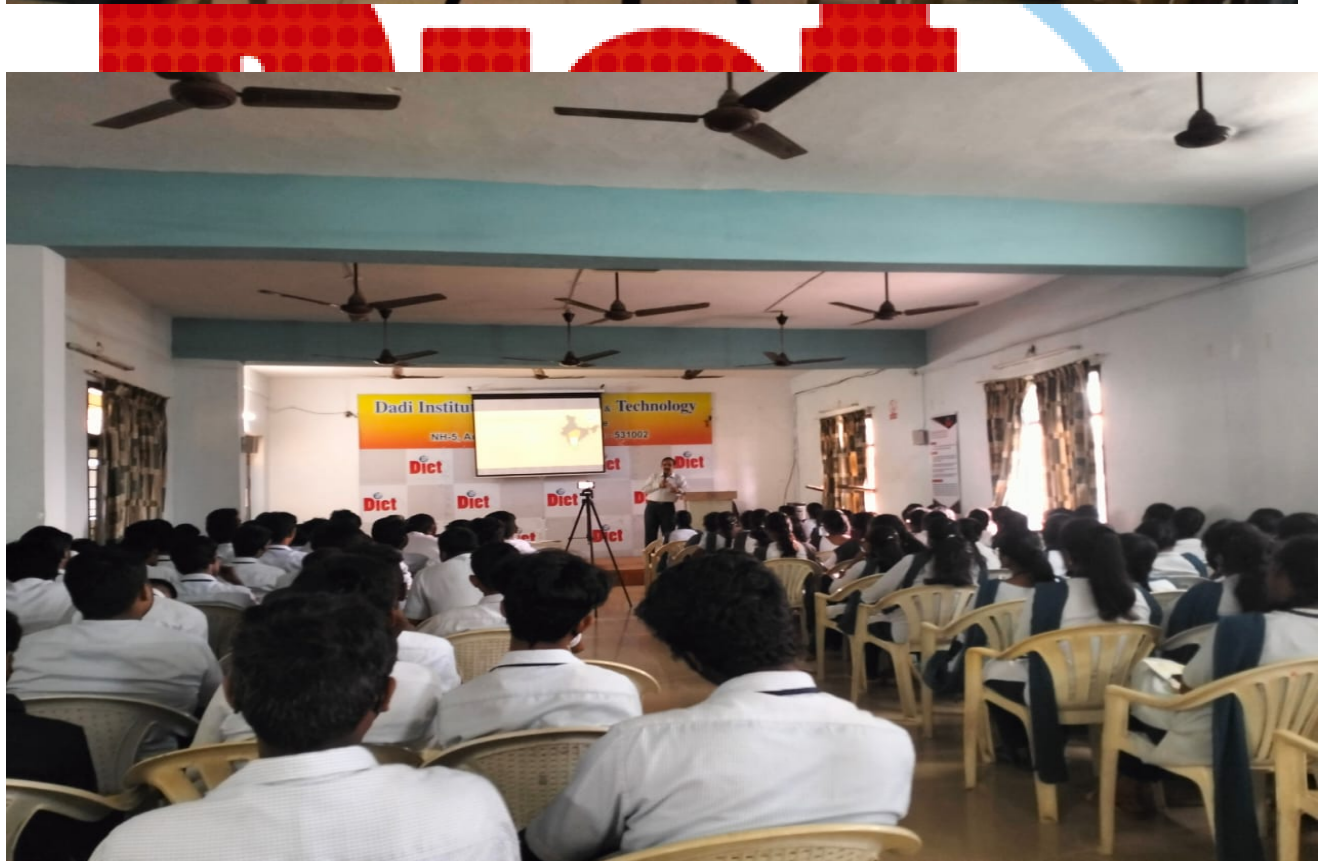
Participants attending the workshop