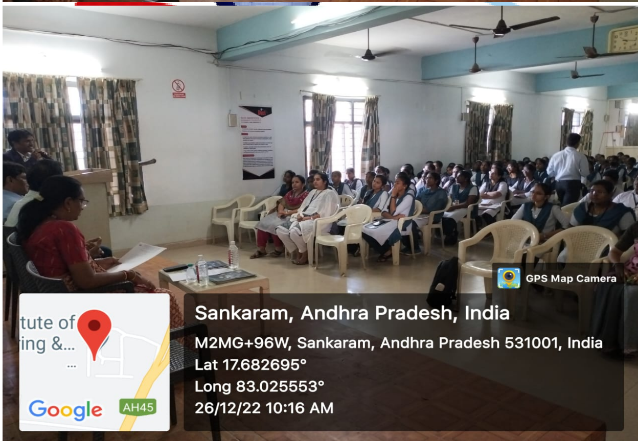
Participants attending the workshop