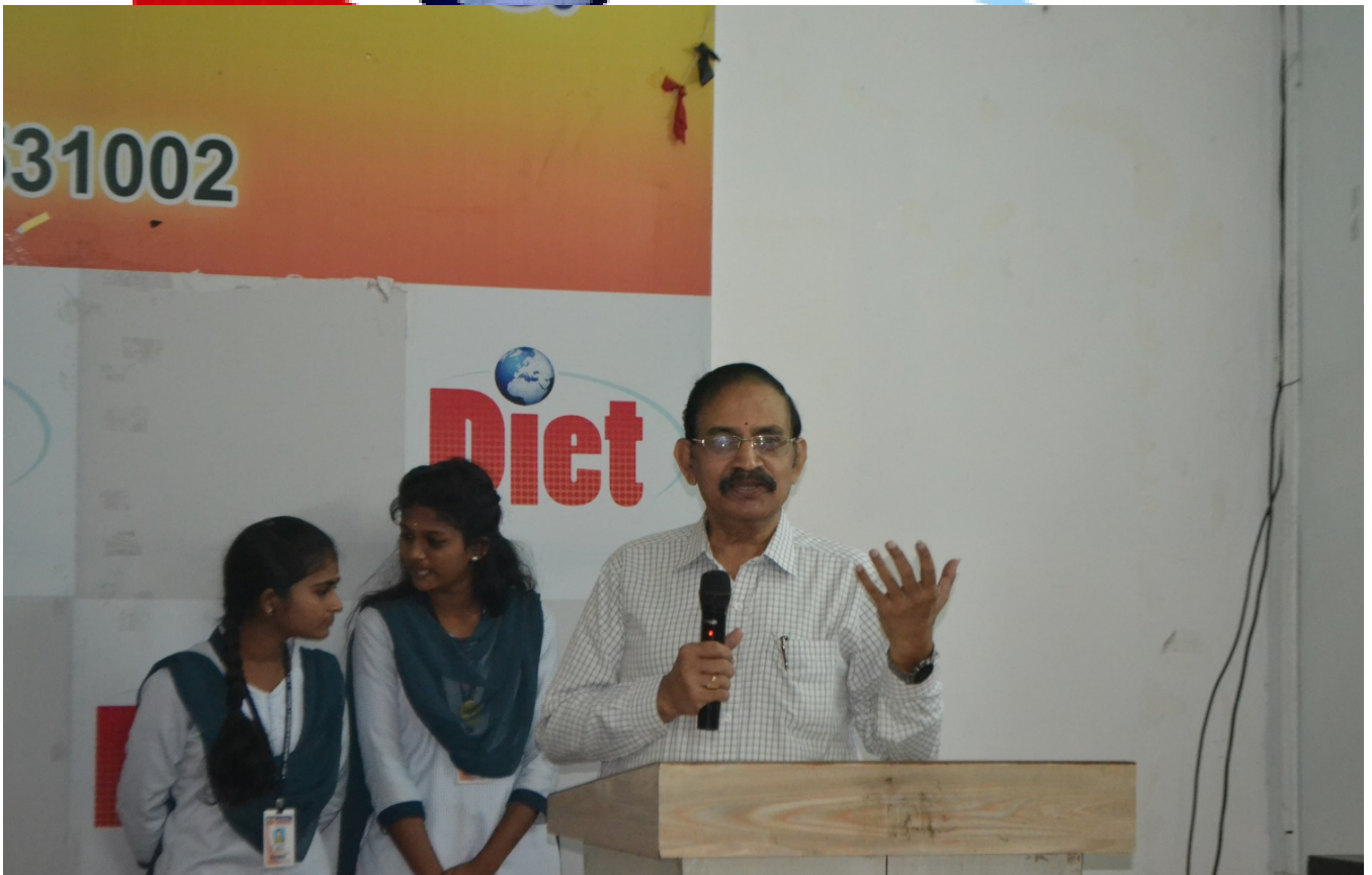
Workshop on “Entrepreneurship and Innovation as Career Opportunity “