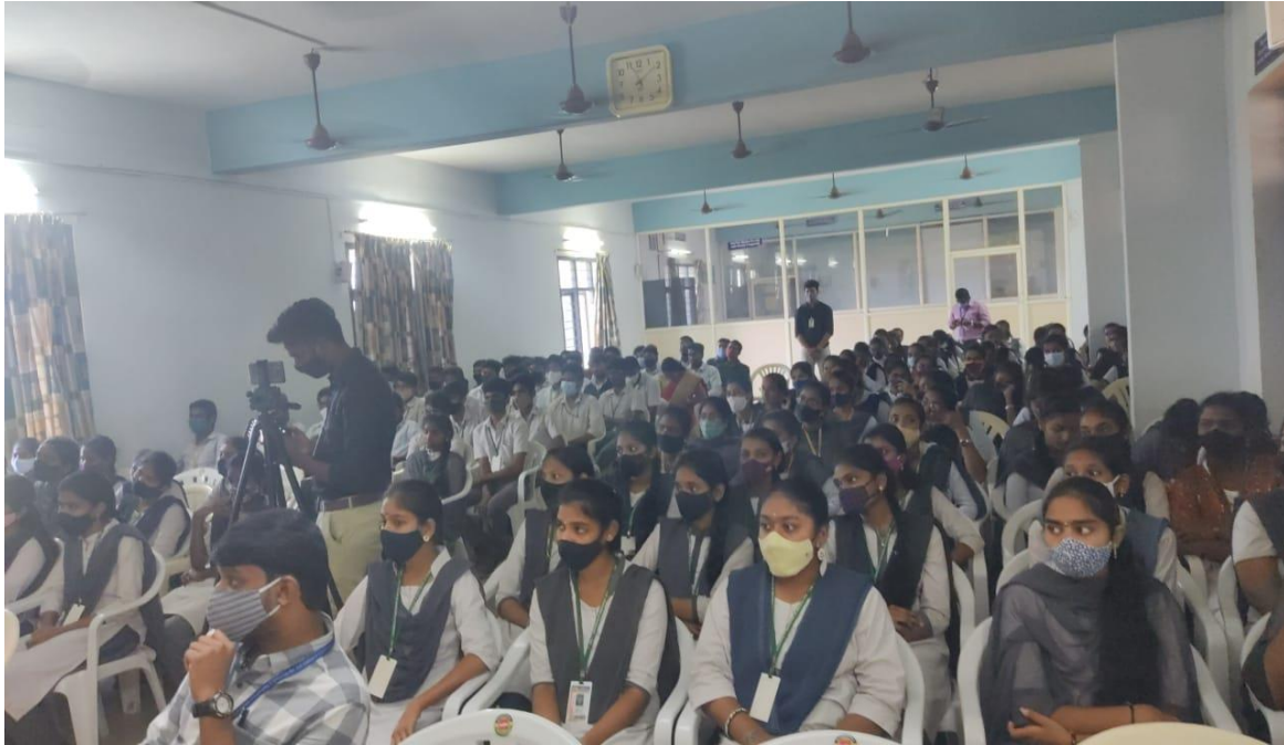
Gathering at Seminar Hall – 2.