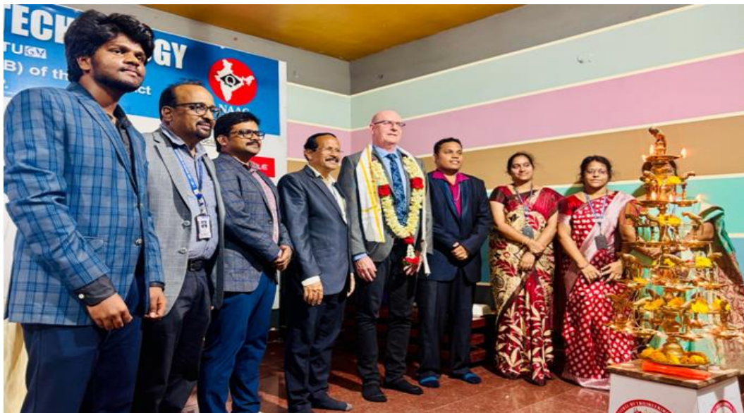
Lamp Lighting Ceremony