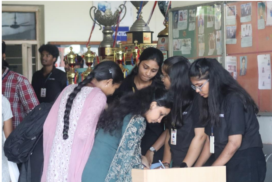
Registration of Participants