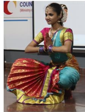
Welcoming the participants & dignitaries with a traditional classical dance performance by DIET IEEE SB Member