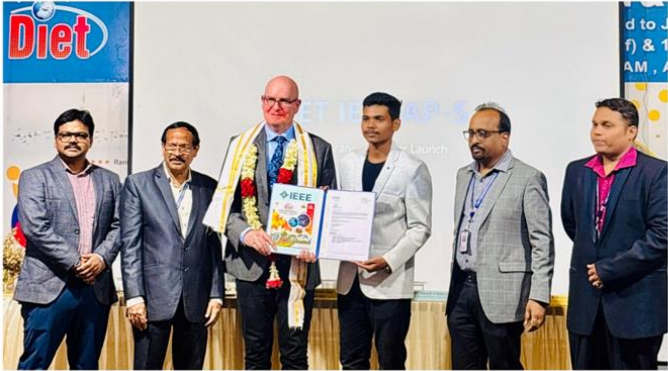
Official Launch of DIET IEEE SB APS & presenting of Chapter formation Letter