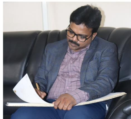
Visitor's Feedback on the Programme