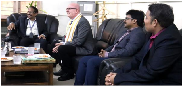
Interaction of Chief Guest & Guest of Honor with the Academic Committee Members of DIET