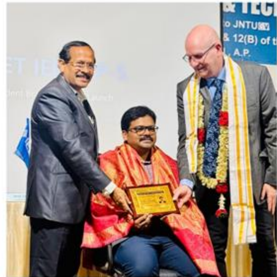
Felicitation to Chief Guest & Guest of Honor