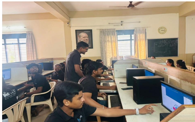
The Office Barriers are helping the Members by solving doubts