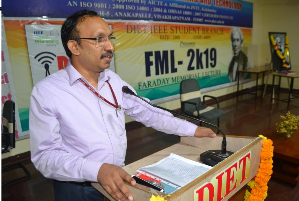
Resource Person delivering the Faraday Memorial Lecture