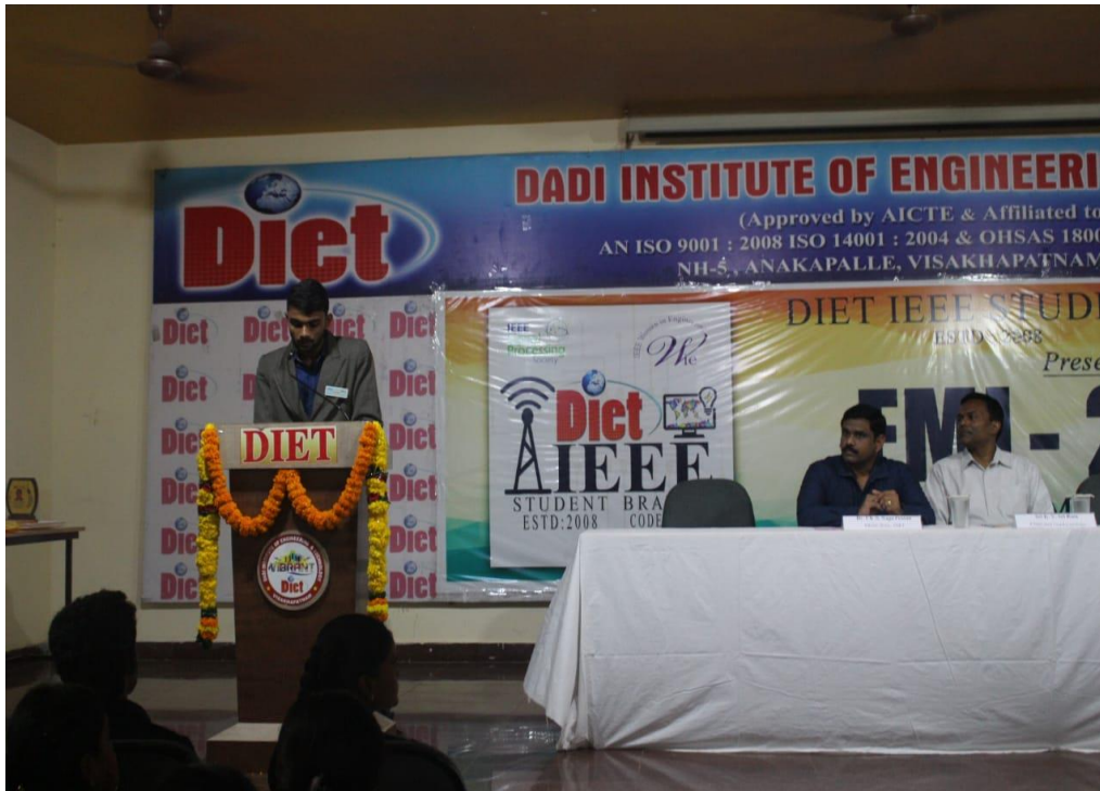
Annual Report by Student Chair