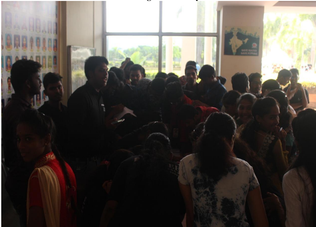
Participants @ Registration Desk