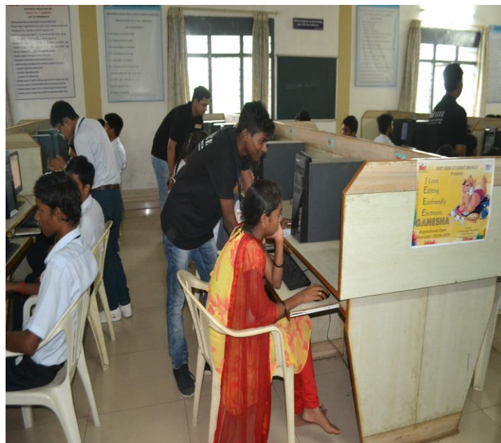
Volunteers guiding students with the design of Ganesha.