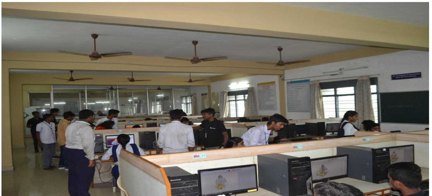
Students actively participating in designing Ganesha.