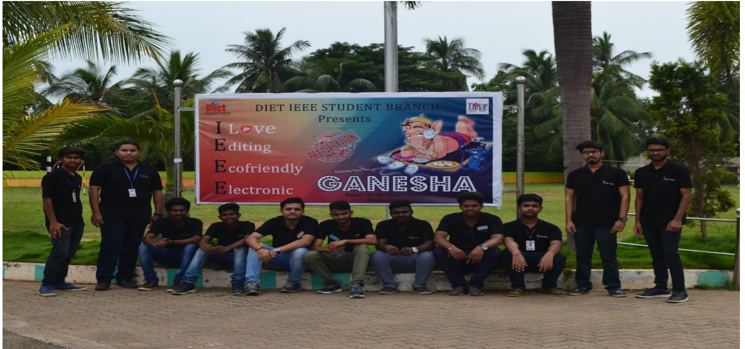
Volunteers of IEEE GANESHA Design Event.