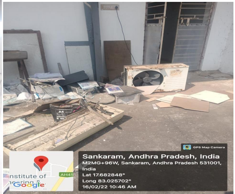
E-waste from computer labs