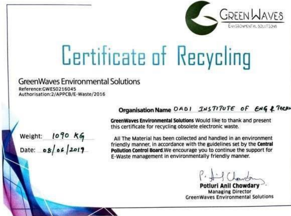
Certificate of Recycling from Green waves Environmental Solution