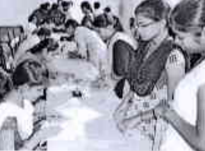
విద్యార్థుల గుంది వివరాలు గీశరిస్తున్న పాస్పోర్టు అధికారులు