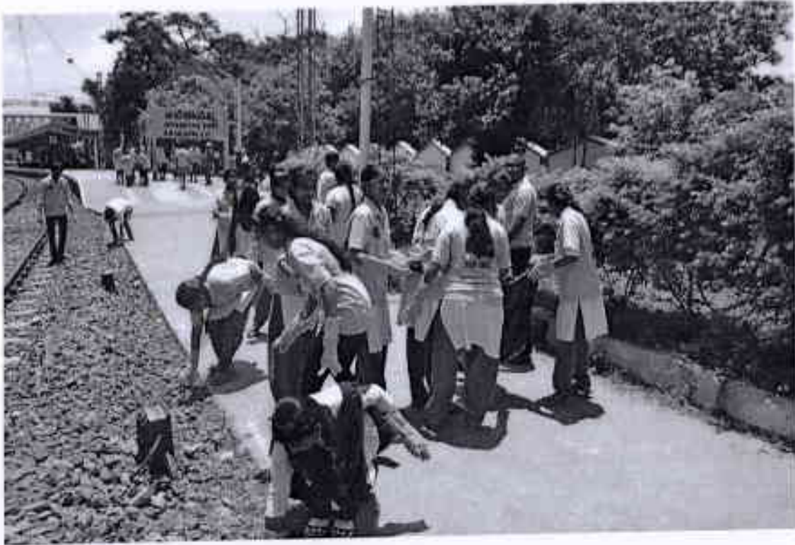
NSS Volunteers cleaning the premises of Railway Station