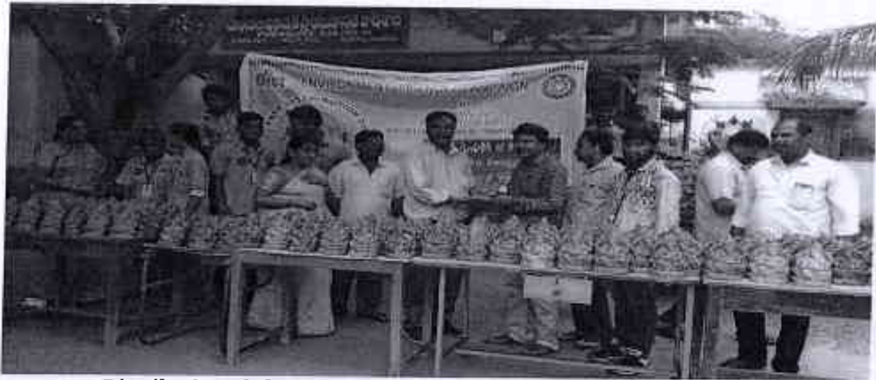
Distribution of Clay Ganesh idols at Maredupudi MP Primary school