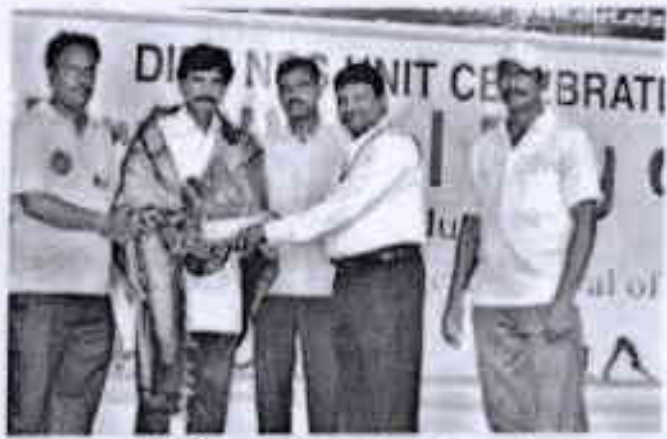
డైట్లో యోగా గురువుకు సత్కారం