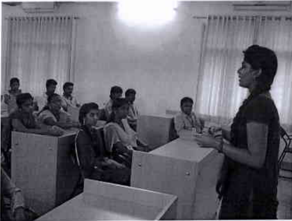
Students expressing their views on Hygiene and cleanliness in Elocution competition organized as part of Swachh Bharat Pakwada.