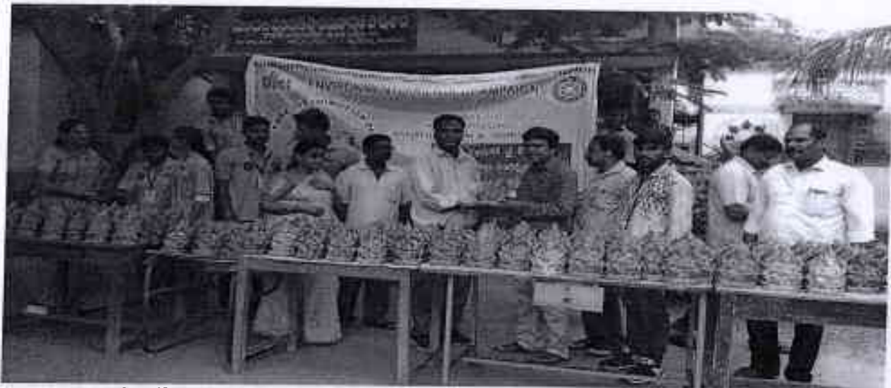
Distribution of Clay Ganesh idols at Maredupudi MP Primary school