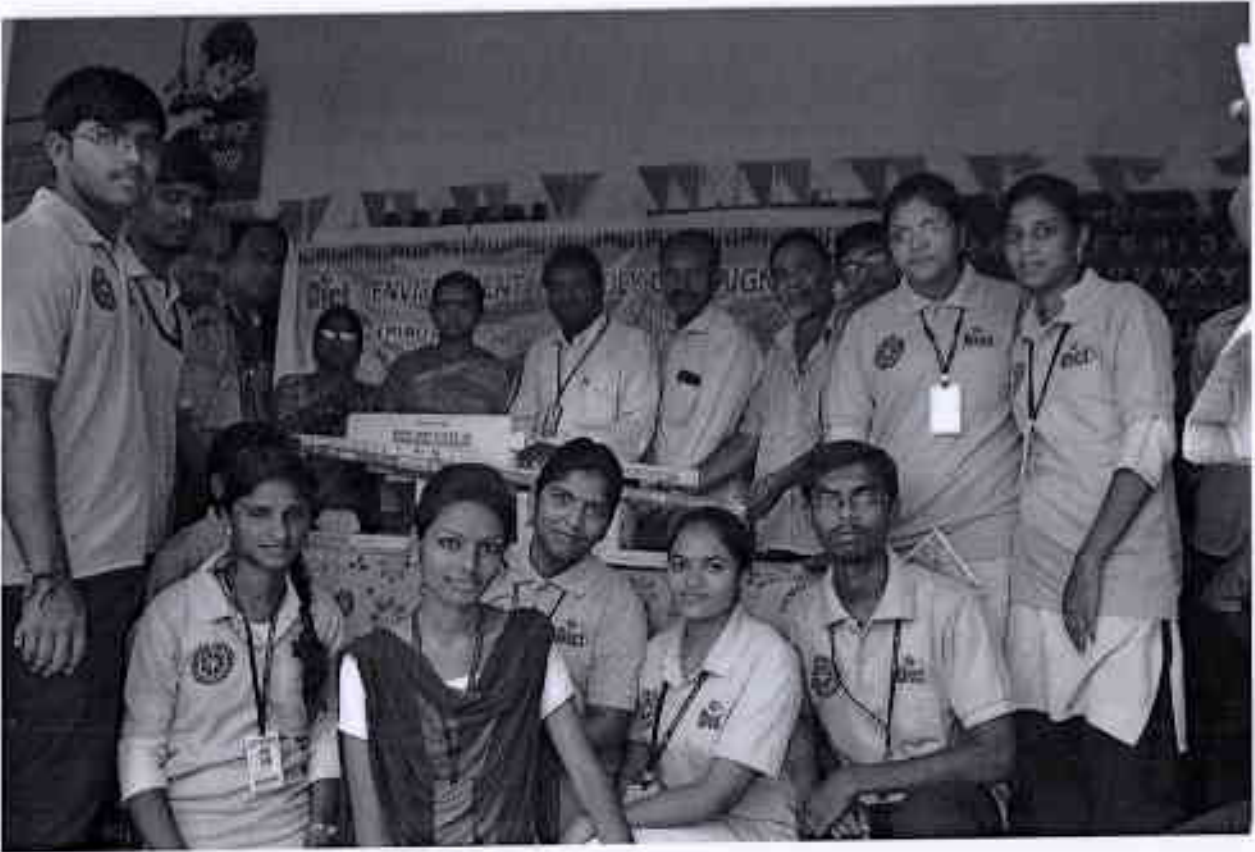
Volunteers after donating Electronic equipment to the MPUP school posing for group pic.