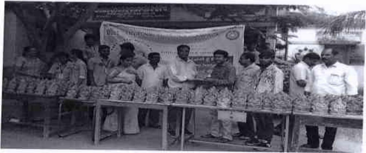
Distribution of Clay Ganesh idols at MP High school Taraka Rama colony, Akkireddiplm village

Utilizing the opportunity, the NSS Volunteers along with the NSS Convener, Sri P.V.Murali visited Mandala Parishad schools of the village and educated the students on viral and bacterial diseases prevailing in the rural areas. They also instructed the preventive measures to be taken to curb the diseases and stay healthy. The school teachers, principals thanked the volunteers of NSS.