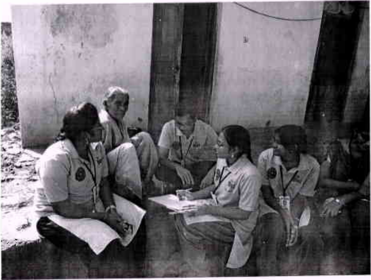
Volunteers educating the orthodox old lady about the need of individual toilets.