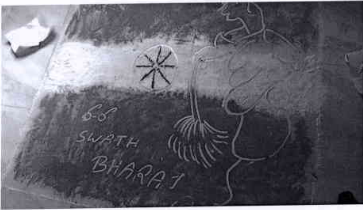
Rangoli depicting the need of clean india-By K. Mounika of III CSE