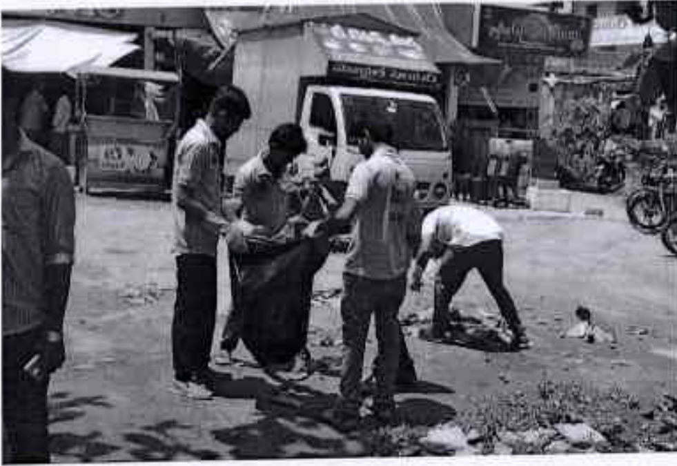
Cleanliness drive at Public Place- RTC complex Anakapalli By NSS Volunteers.