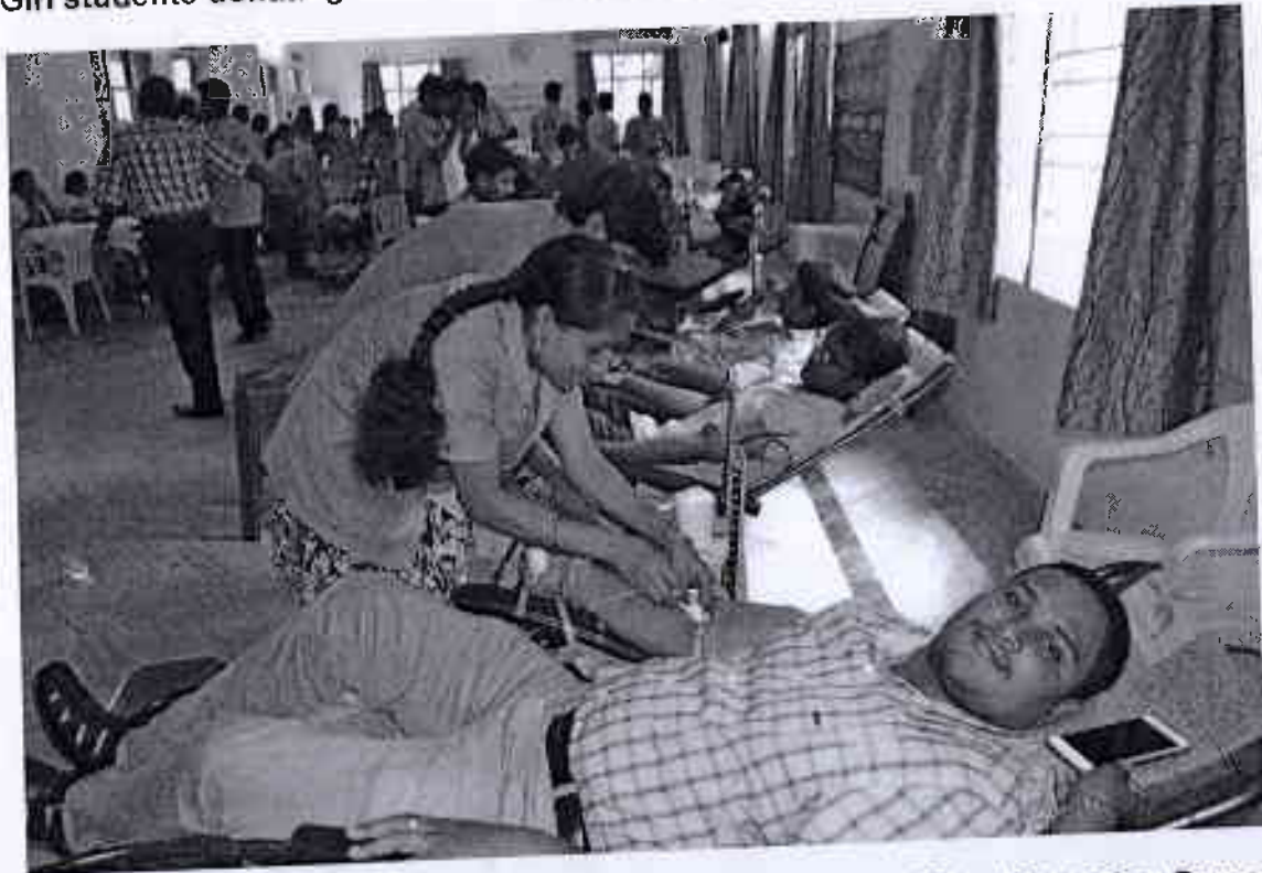
Volunteers and students donating blood during the Mega Blood Donation Camp.