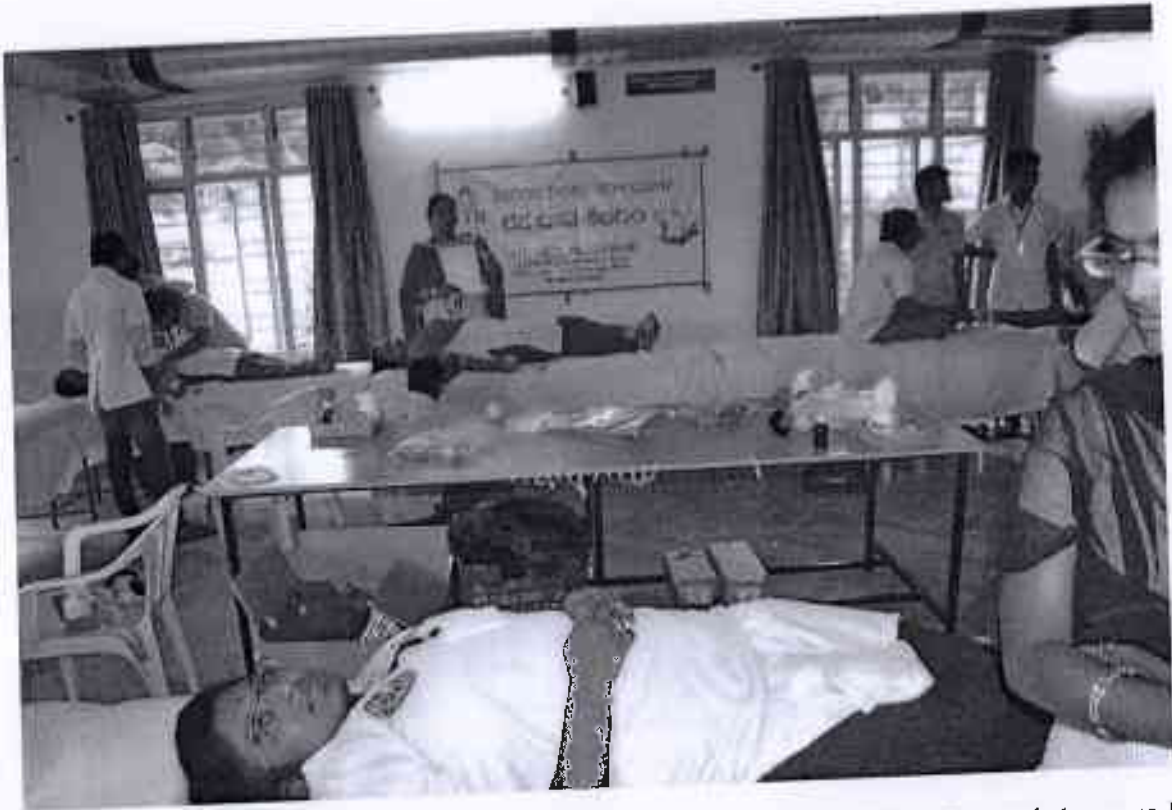
Girl students donating blood and proving that they too are strong enough to save lives.