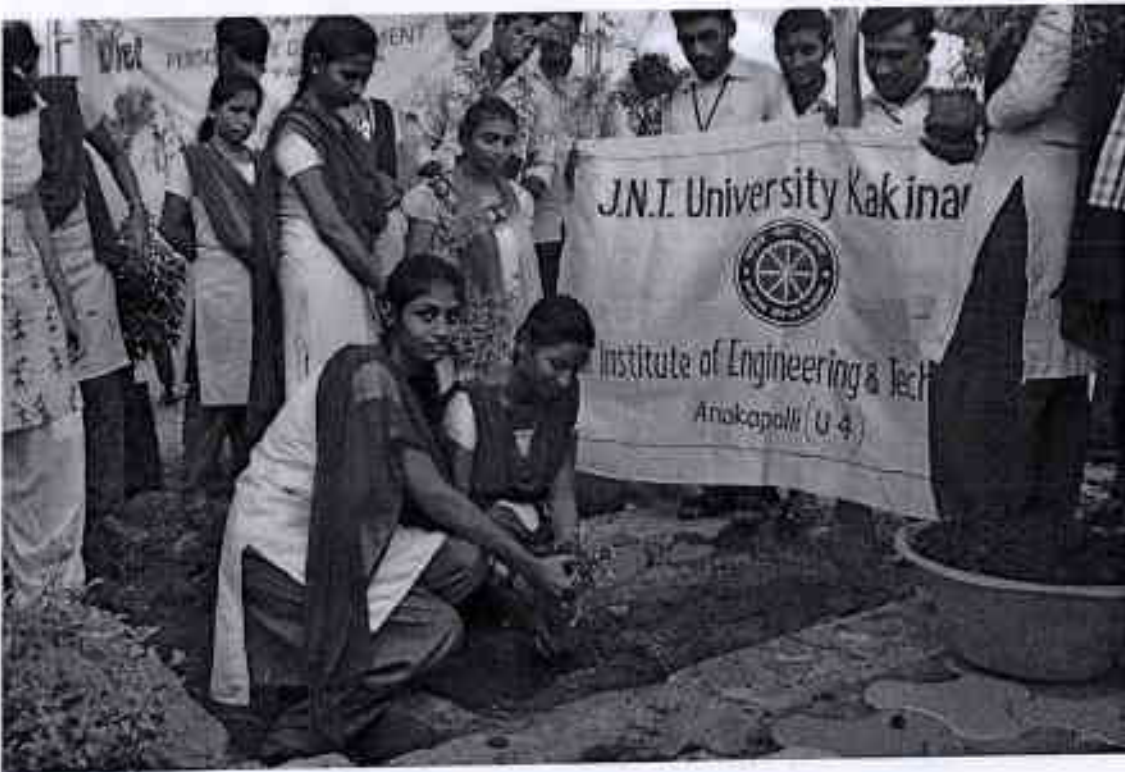
Volunteers planting a sapling as part of Green Day of Swachh Bharat Pakwada