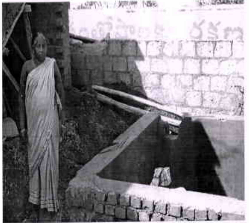
Toilets under construction after the ODF drive by mandal development office survey.