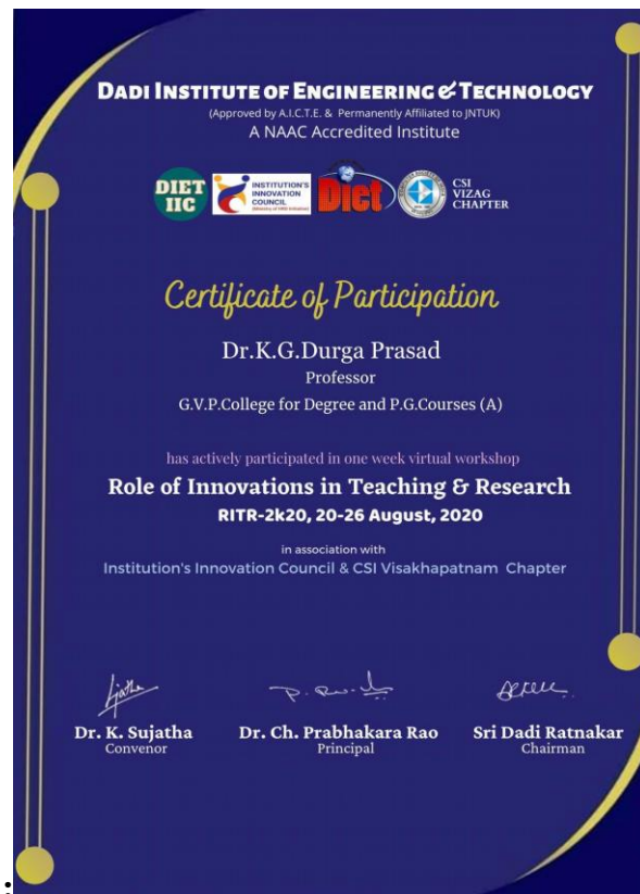
Fig. 14 Sample Certificate