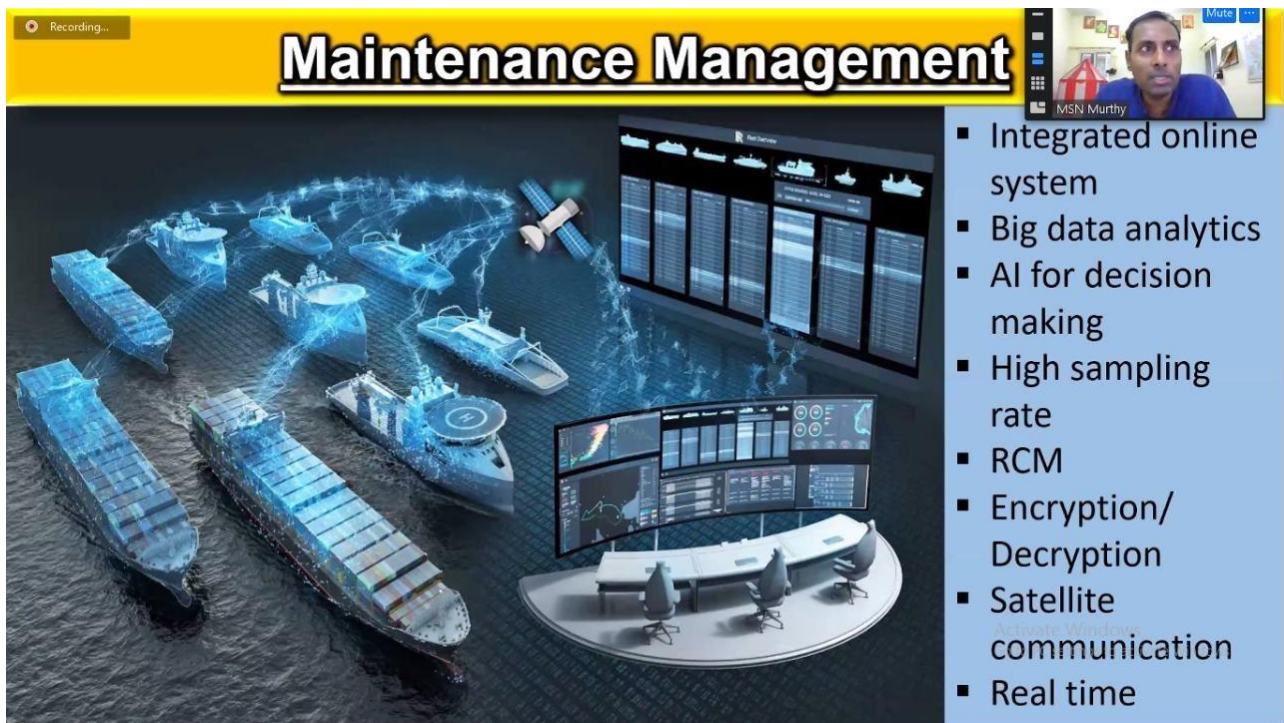
Fig. 10 screenshots of session