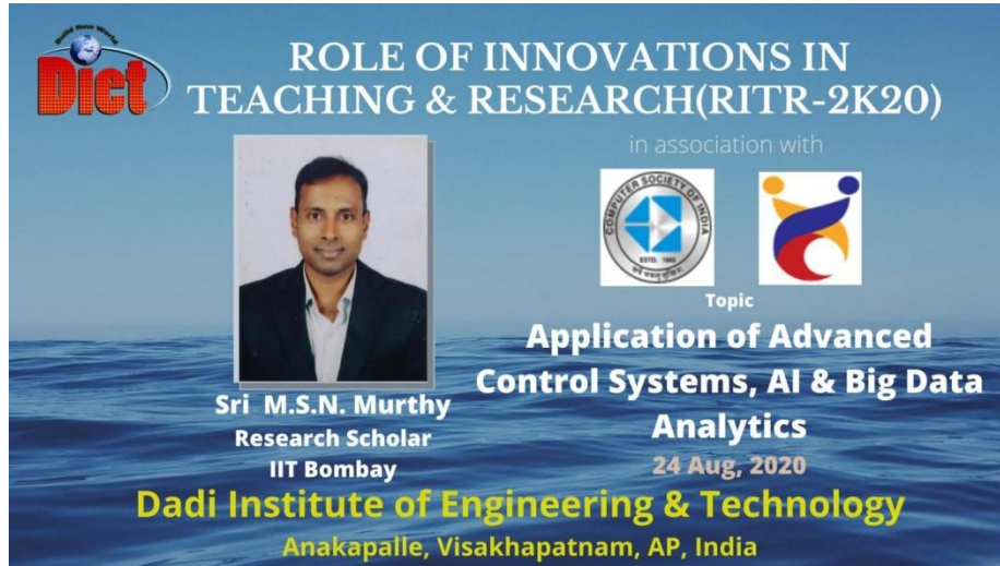
Fig. 6 Poster for Application of advanced control systems , Ai and Big Data Analytics