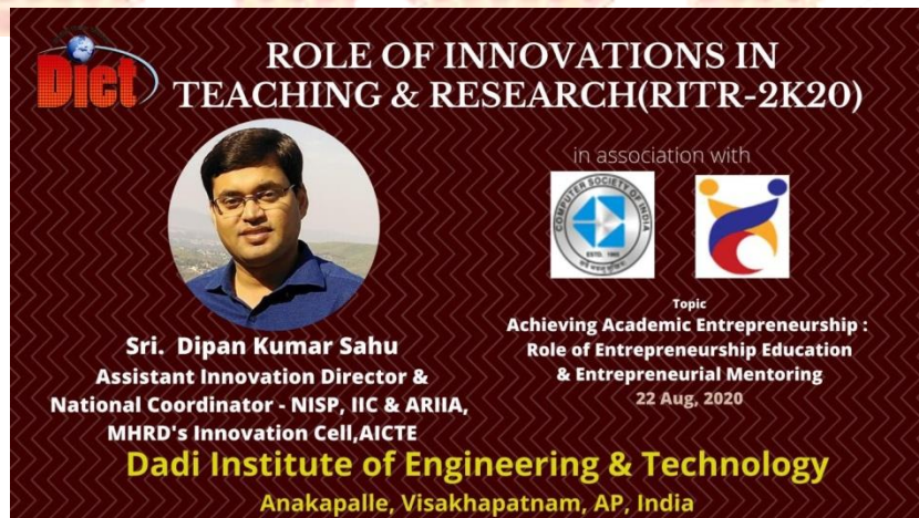
Fig. 5 Poster for Achieving Academic Entrepreneurship