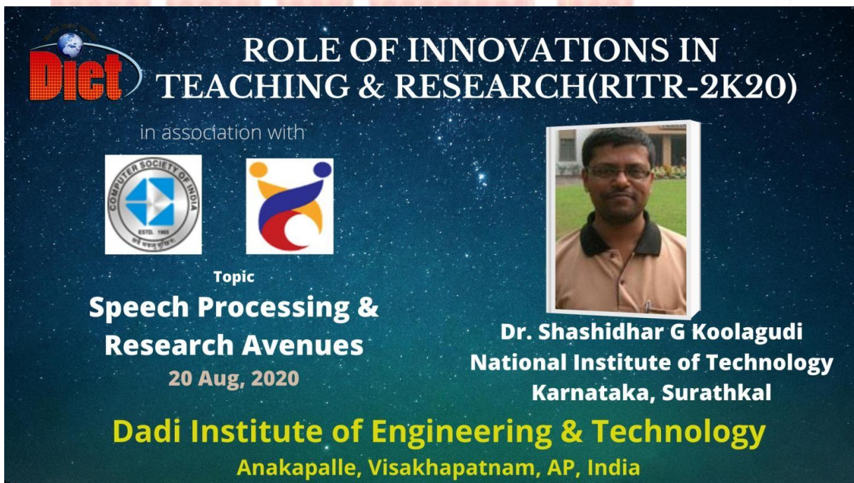
Fig. 3 Poster for Speech Processing & research avenues workshop

The first day session is taken by Dr.Sasidhar G Koolagudi from NIT Surathkal who made us aware about the recent research trends in speech processing.