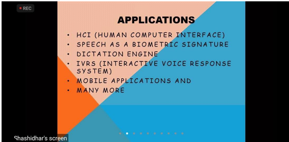
Fig. 9 screenshots of session