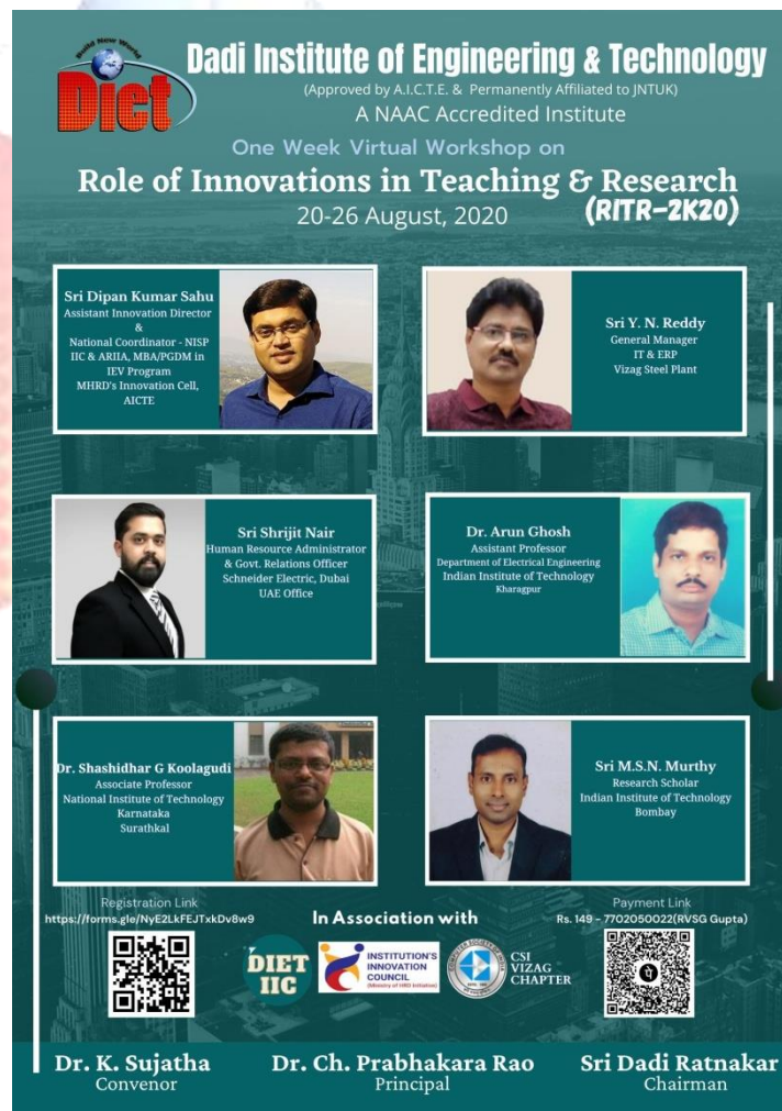
Fig.1 Poster for one day virtual workshop RITR 2k 20