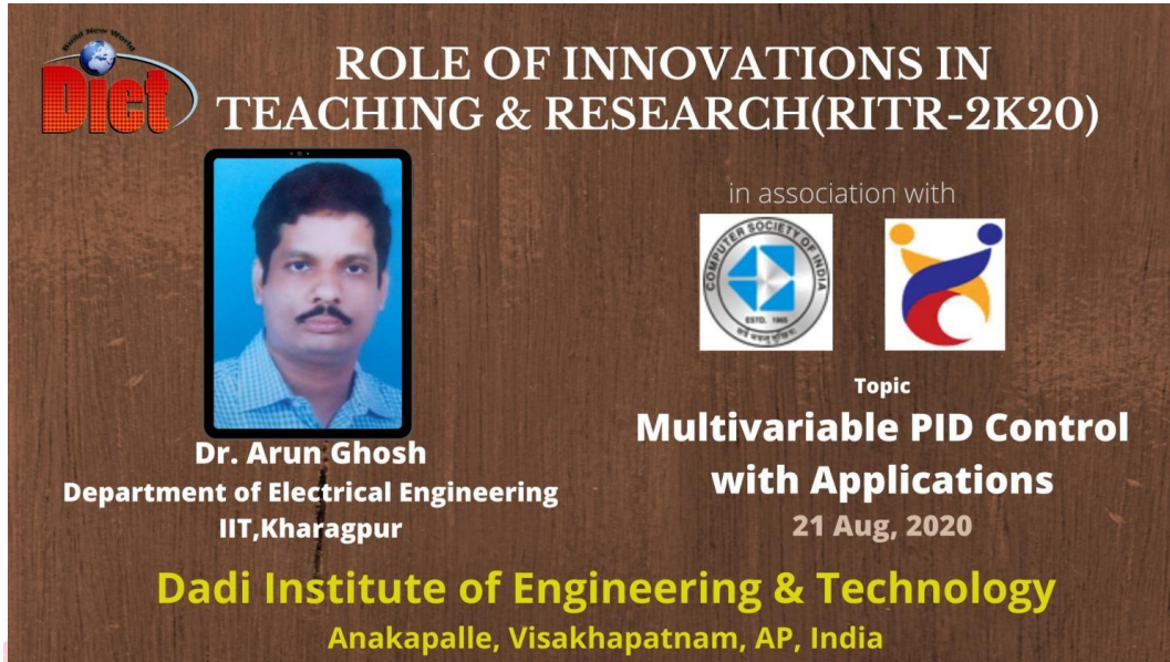
Fig.4 Poster for Multivariate PID Control with applications

Second day session is taken by Dr. Arun Ghosh from IIT kharagpur where he talked about PID controllers which is used for automatic process control applications in industry.