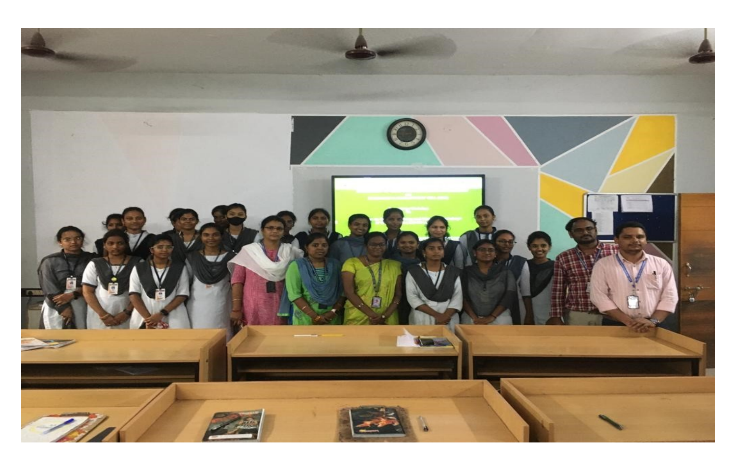
Group Photo with Participating students