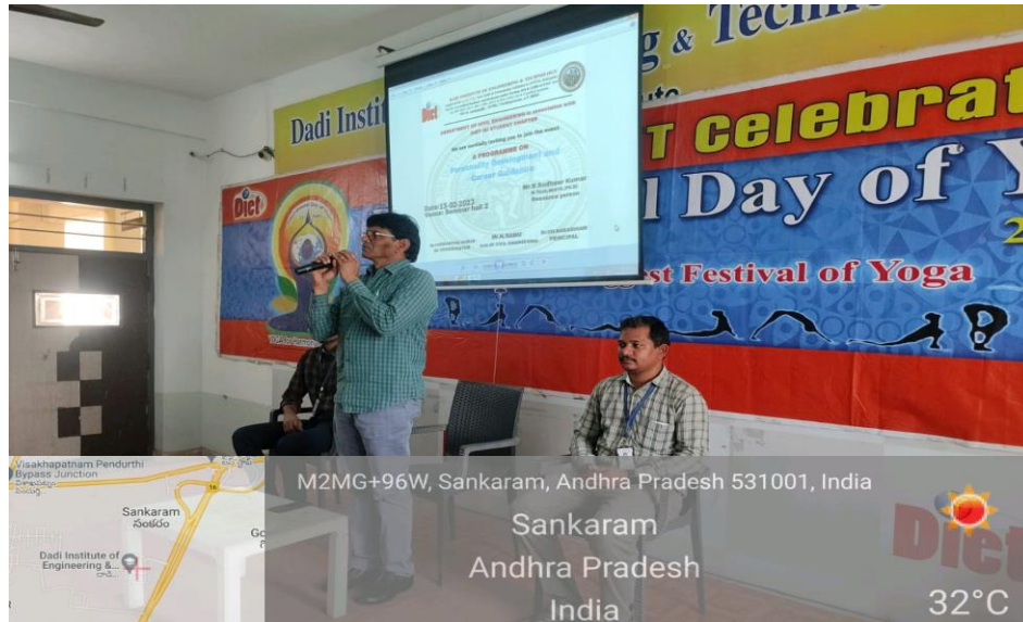
Principial Sir addressing the gathering