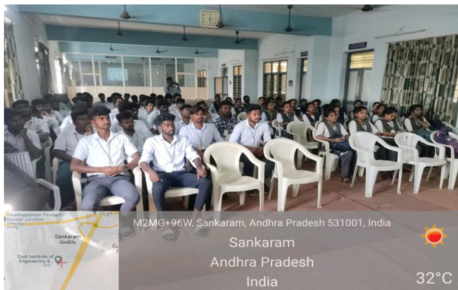
Students participated in the IE(I) Session