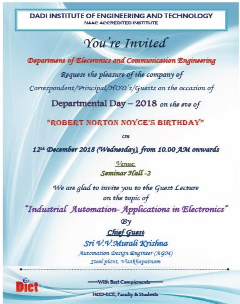
Fig 1: Invitation on Geust Lecture

Department Day Guest Lecture On Industrial Automation –Applications in Electronics (12th Dec 2018) Organized by Department of Electronics & Communication Engineering