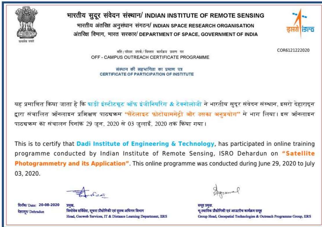
Fig. Nodal Centre Certificate