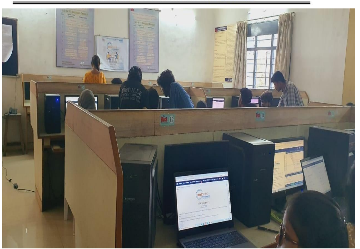
Figure 2 IEEE Xtreme 16.0 Participants