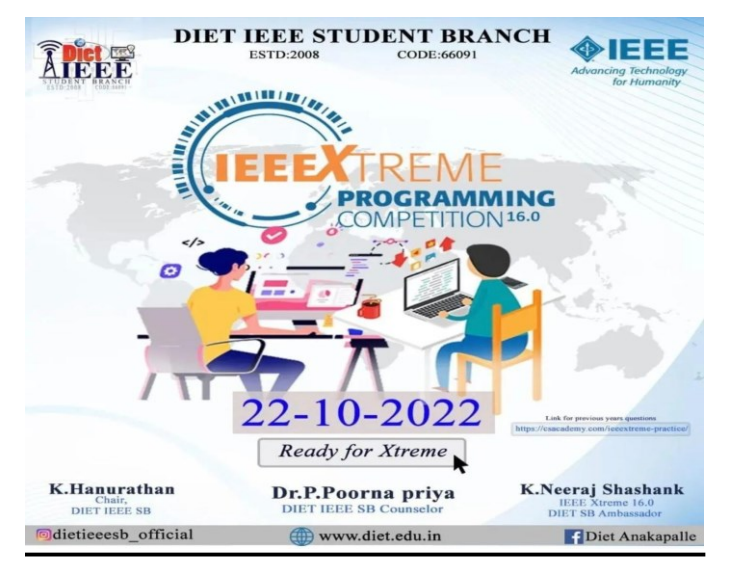
Figure 1 Poster of IEEE Xtreme 16.0

IEEE Xtreme 16.0 started at 5:30 AM(IST) on 22/10/2022 and ended at 5:00 AM(IST) on 23/10/2022