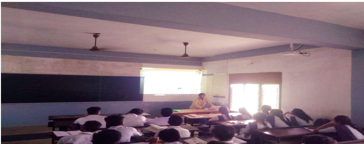
Figure 1 Session 1

The Department of Electrical and Electronics Engineering of Dadi Institute of Engineering & Technology in association with datapro, Visakhapatnam and Institute Innovation Council (IIC) conducted a Workshop Session on Innovation/Prototype Validation – Converting Innovation into a Start-up through Full Stack Developers prototype validation on 17 th August 2023 at LH-32 and Lab-8 in the institute premises. This course is planned to Learn the advanced Technology for students.