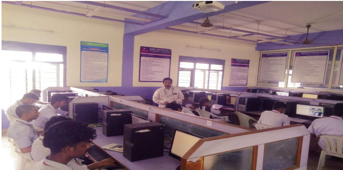
Figure 3 Session 3