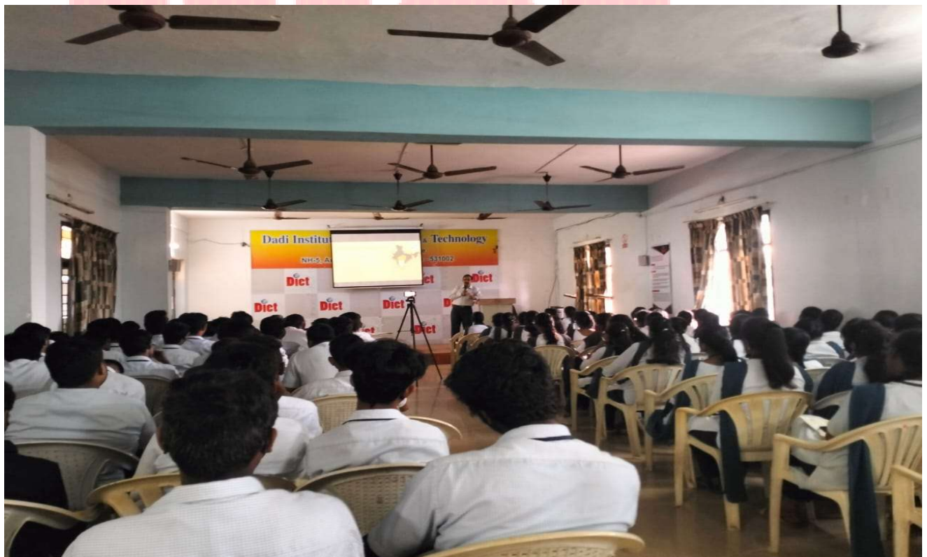
Participation of students in the workshop