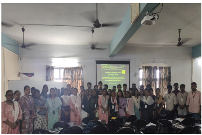
Students & Faculty Participation in the IIC Program