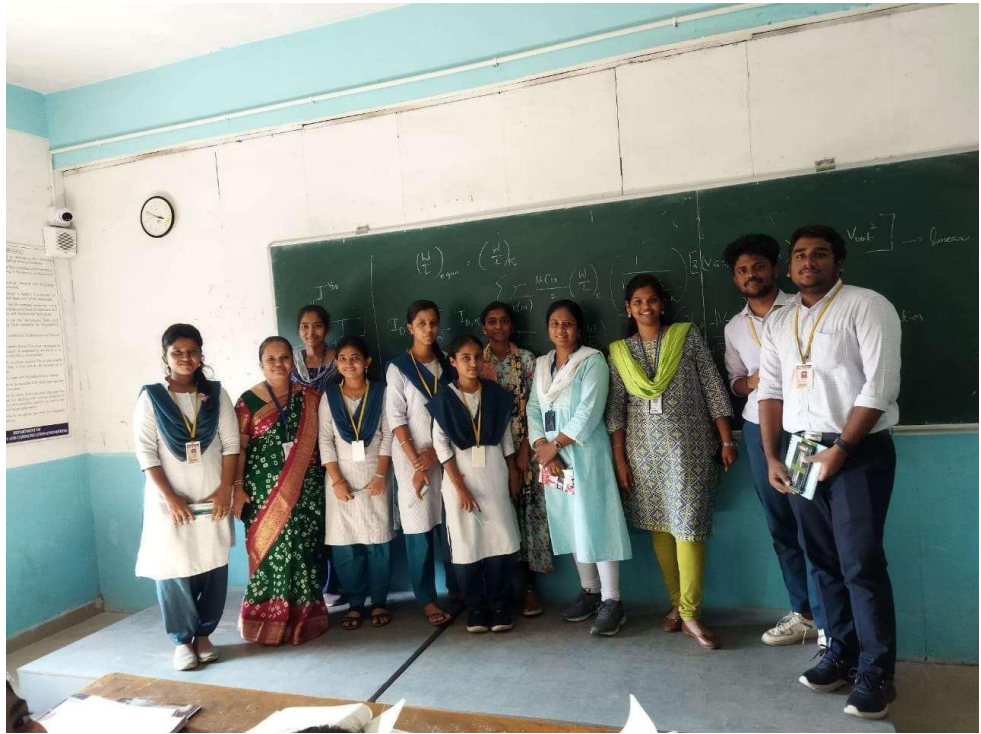
II B.Tech ECE student participants for JAM session conducted on 2/5/2023