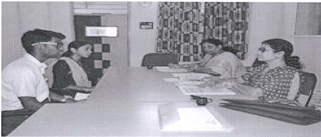
Students undergoing Speaking Skills Test

Cambridge English BEC B1 Examination was successfully conducted for 100 students of II- & III-year B. Tech students in Dadi Institute of Engineering & Technology on 8 th and 9 th March, 2017. The students thanked the management and the principal for providing such opportunity for them.