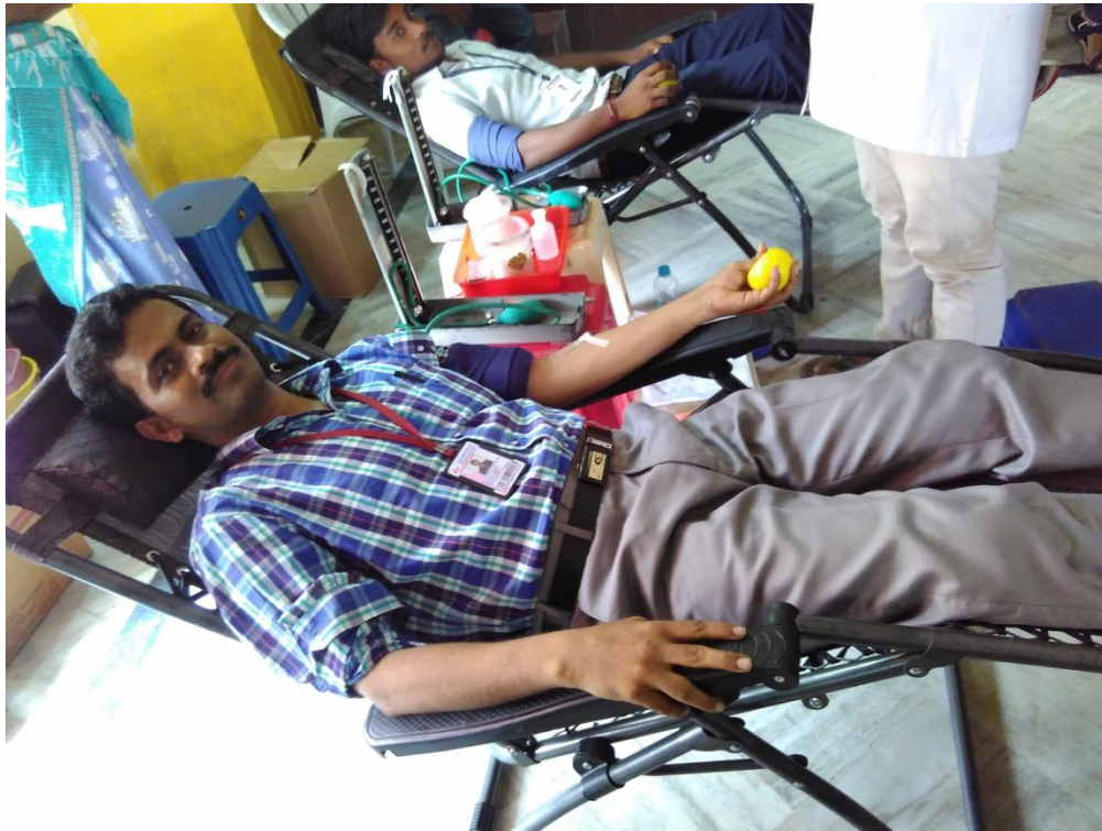
fig: student volunteers and staff mega blood donation camp