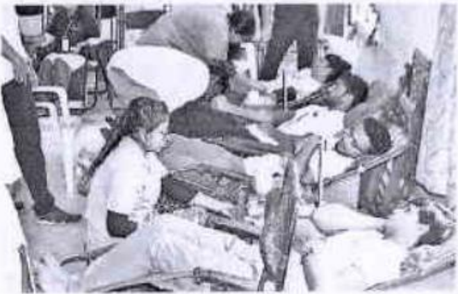
రక్తదానం చేస్తున్న యువకులు