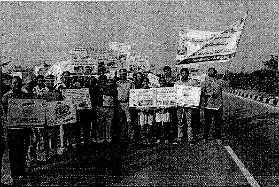
fig: Student volunteers participating the road Safety awareness