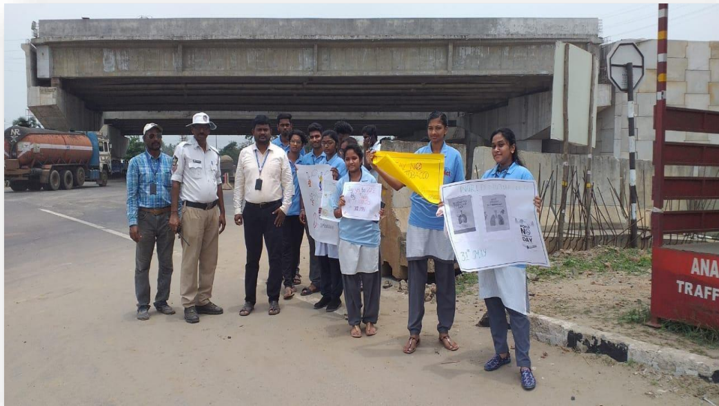
NSS student Unit conducting awareness y-junction, Anakapalle