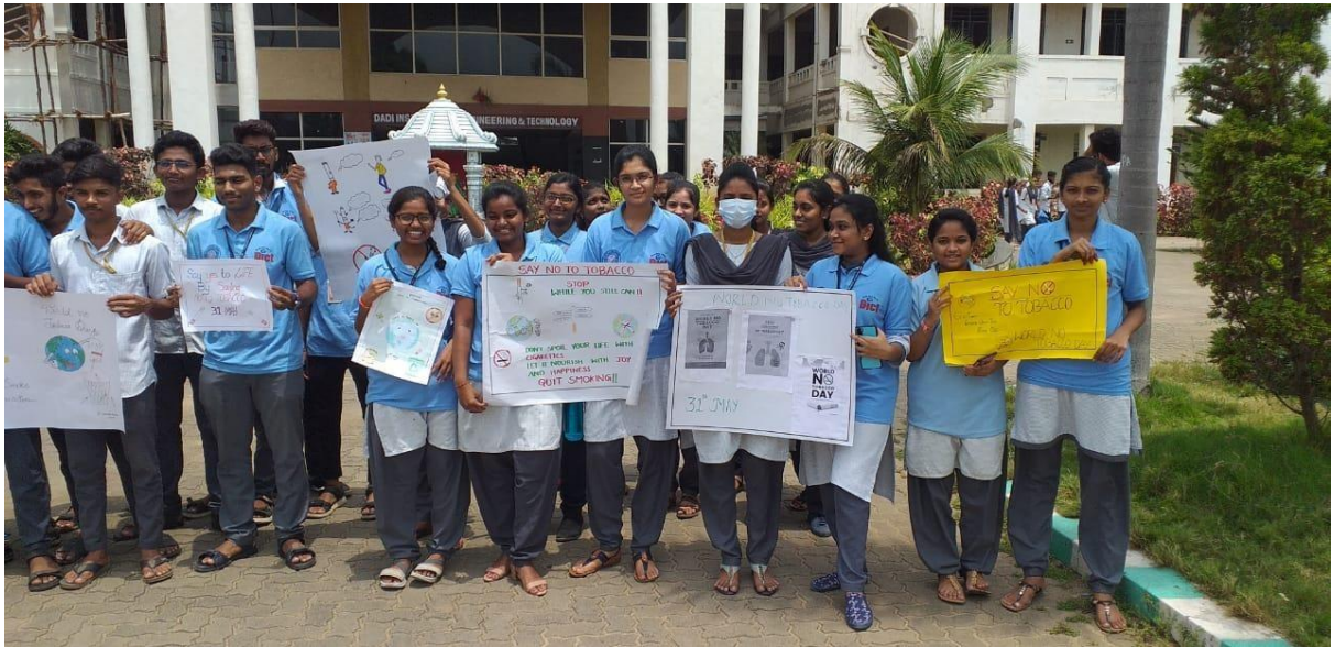
NSS student Unit conducting awareness in college campus with slogans

Mobile: +91 9963981111, Website: www.diet.edu.in , E-mail: info@diet.edu.in