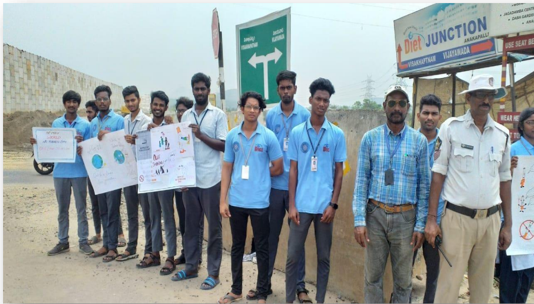
NSS student Unit conducting awareness y-junction, Anakapalle