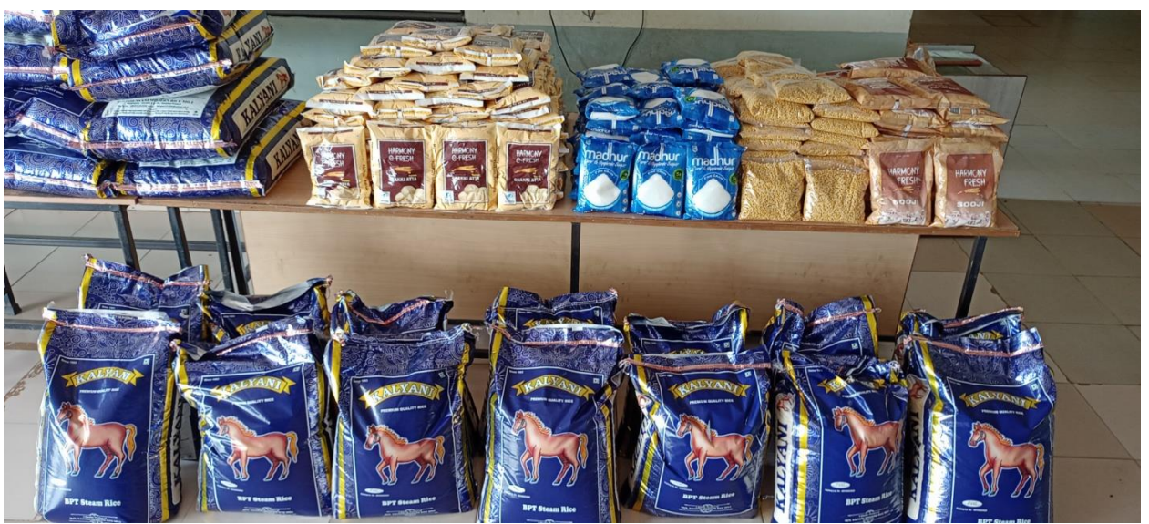
fig:1 Provisions to the poor and needy people arranged in college lobby

Mobile: +91 9963981111, Website: www.diet.edu.in, E-mail: info@diet.edu.in