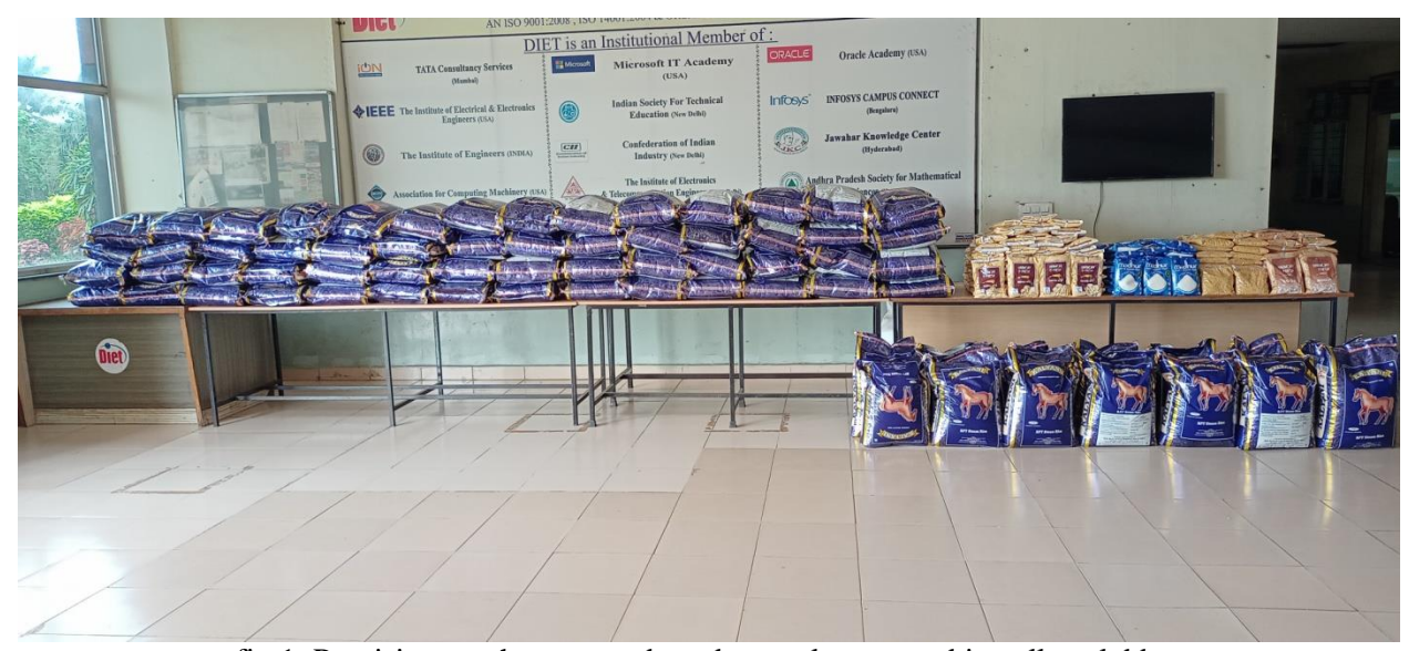
fig:1 Provisions to the poor and needy people arranged in college lobby

In this Programme, DIET NSS officer, HODs, Faculty members and NSS student volunteers participated and extended their helping hand to make this programme grand success.