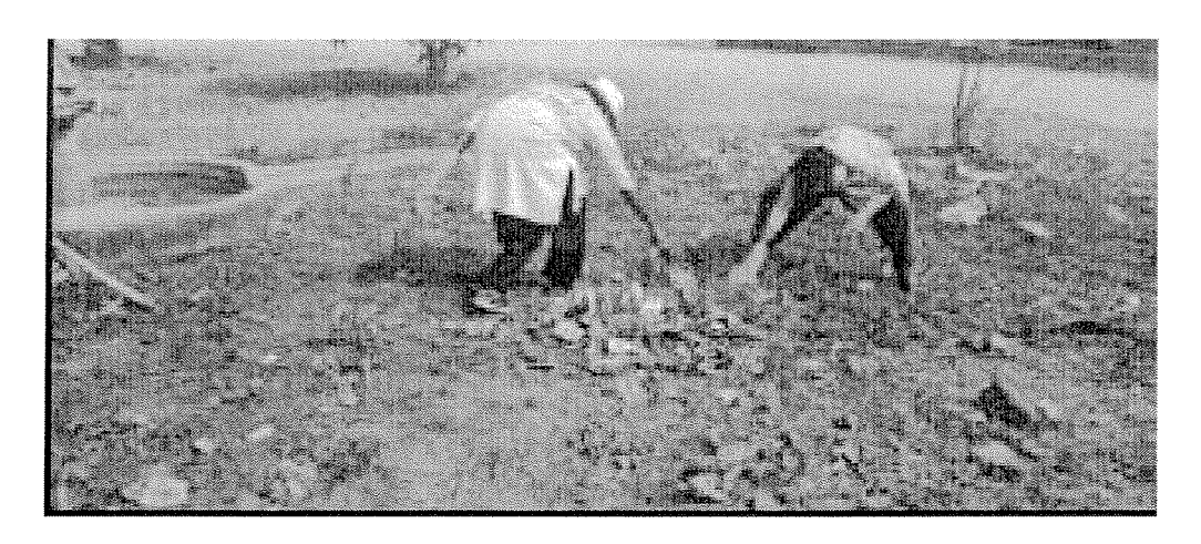
Fig2: Student Volunteers cleaning school surroundings in akkireddiplaem