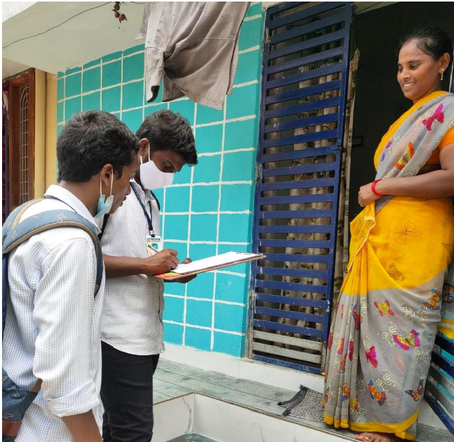
Figure: Suggestions on Organic farming conducted by NSS unit