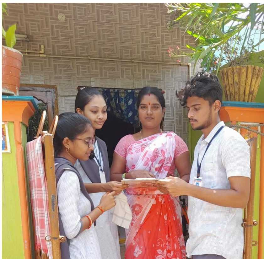
Figure: Awareness camp on Organic farming conducted by NSS unit

In this event, all student volunteers and staff have participated. Principal Sir addressed the gathering and told the importance of Organic farming describes how it uses organic elements and composts and tries to expand soil richness by taking care of soil miniature existence with build-ups from life and also the importance of nature.