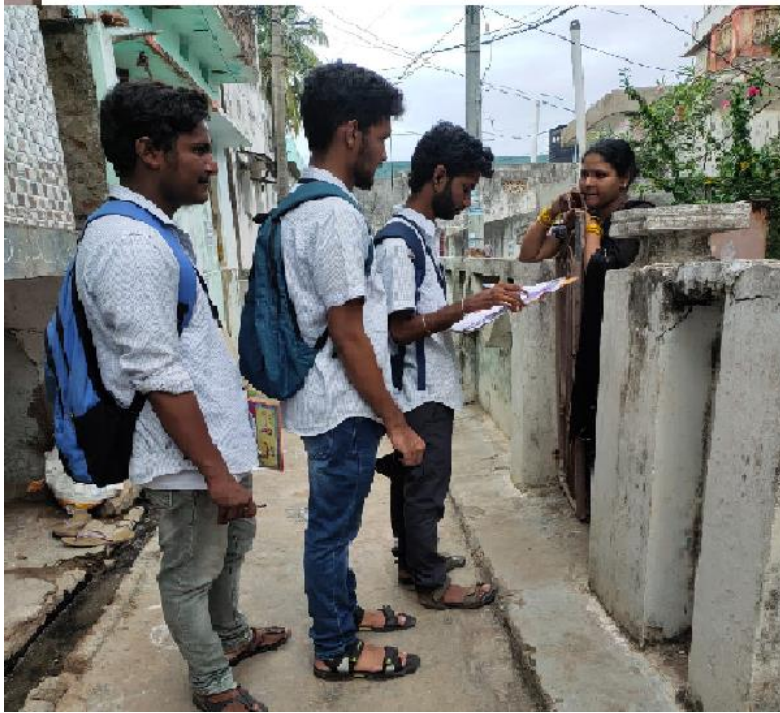
Figure: Asking Questions on Organic farming conducted by NSS unit