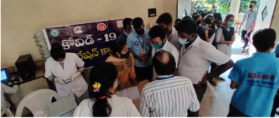
figure: Registration of Students on CoWin Portal

Phone: 9963981111, 9963694444 E-Mail: info@diet.edu.in Web: www.diet.edu.in