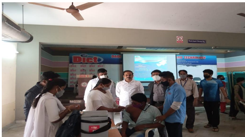
figure: Inauguration of the Mega Vaccination Drive