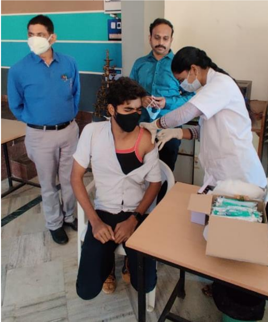
figure: Vaccination of Students and Staff

Phone: 9963981111, 9963694444 E-Mail: info@diet.edu.in Web: www.diet.edu.in