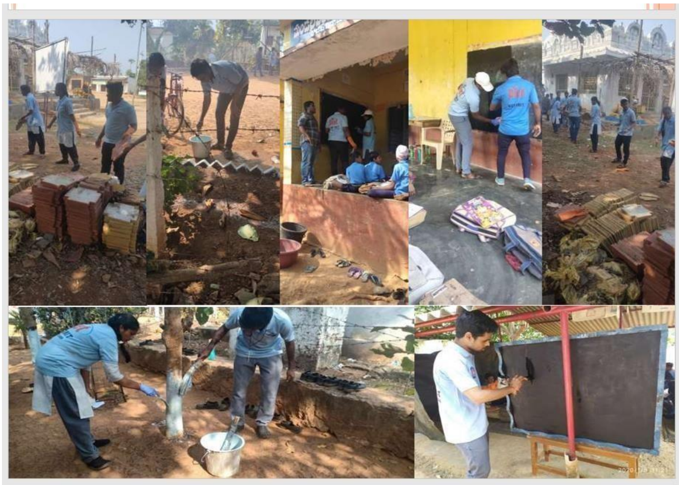
NSS Unit student volunteers visited Maredupudi village on 9-1-2020