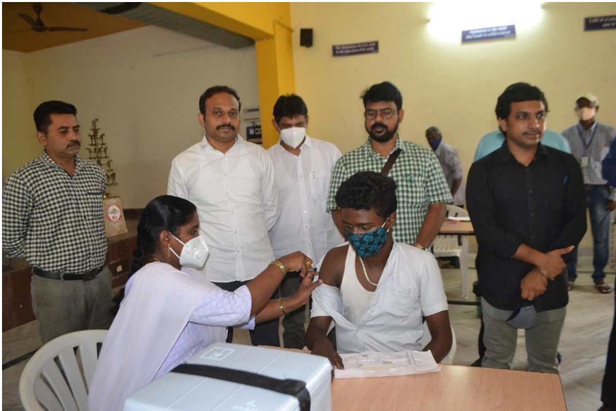
Vaccination of Students and Staff