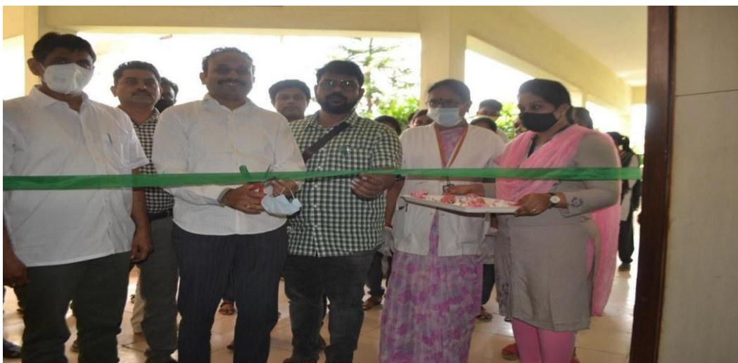
Inauguration of the Mega Vaccination Drive