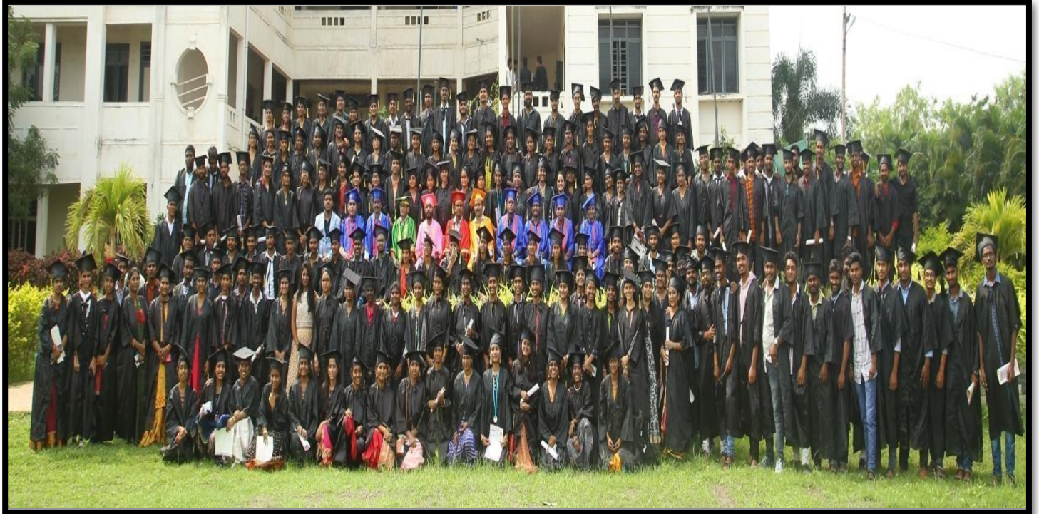
B.Tech. 2017-2021, Batch Graduates