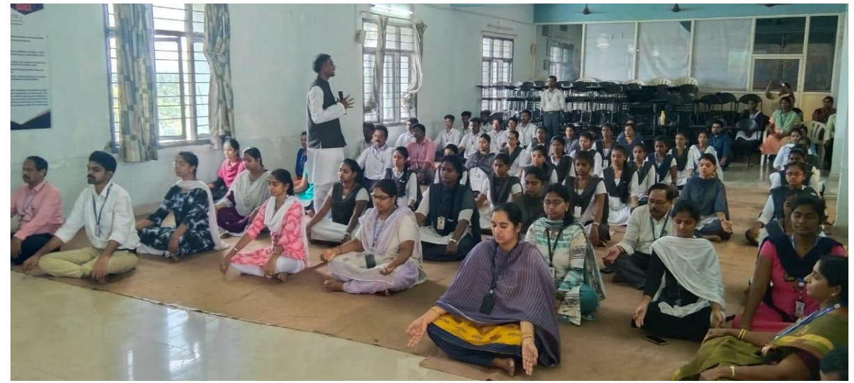
yoga asanas and pranayama practice