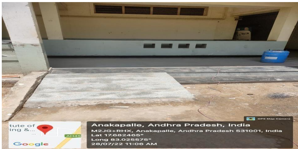
Ramps in the Institute