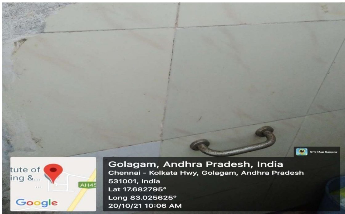
Wash rooms for disabled persons