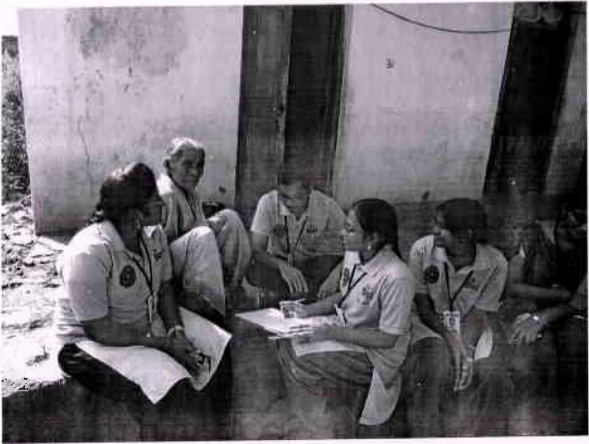
Volunteers educating the orthodox old lady about the need of individual toilets.