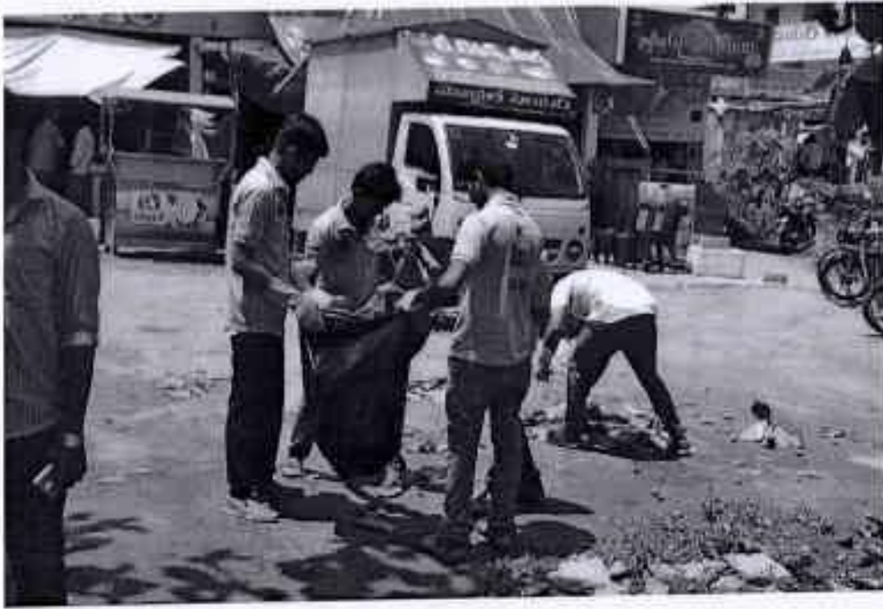
Cleanliness drive at Public Place- RTC complex Anakapalli By NSS Volunteers.