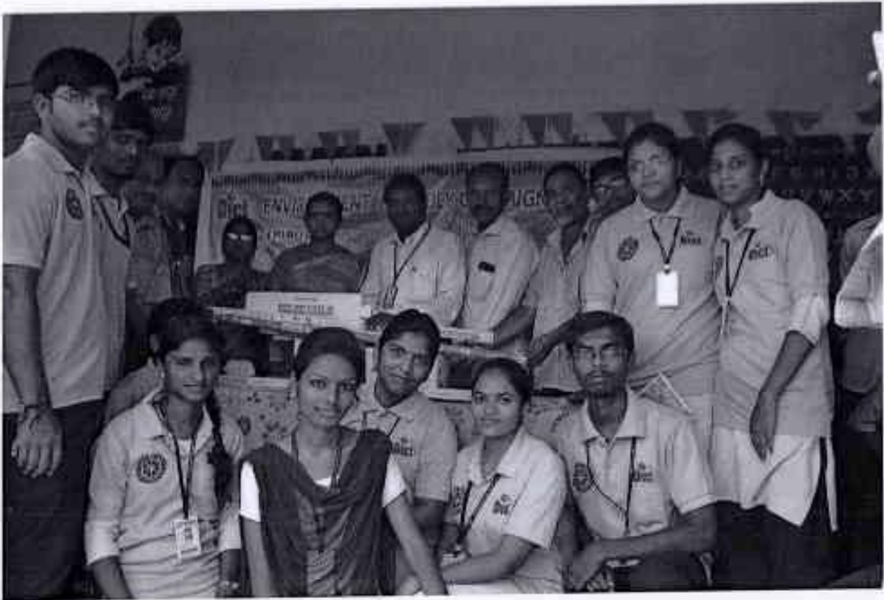
Volunteers after donating Electronic equipment to the MPUP school posing for group pic.