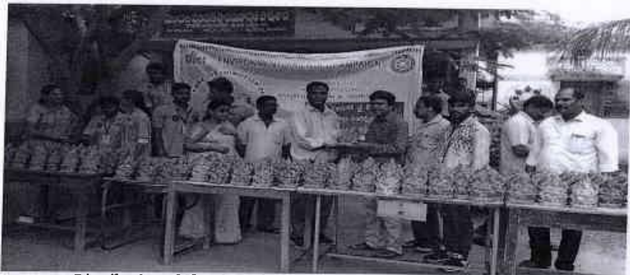
Distribution of Clay Ganesh idols at Maredupudi MP Primary school