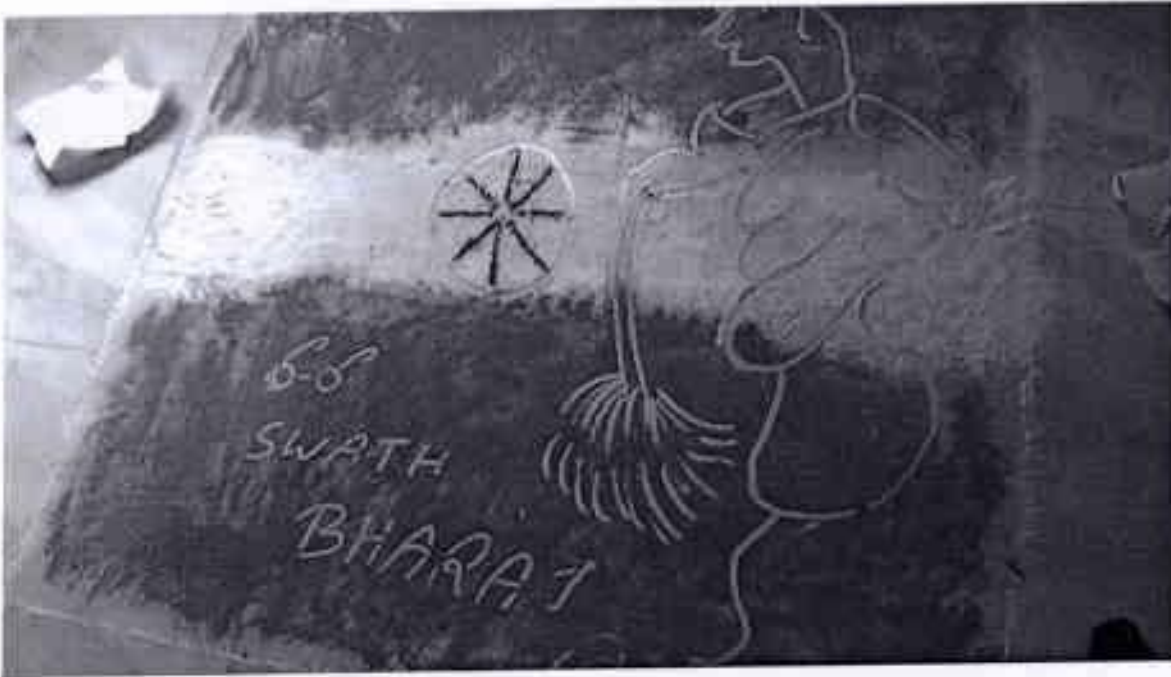
Rongoli depicting the need of clean india-By K. Mounika of III CSE