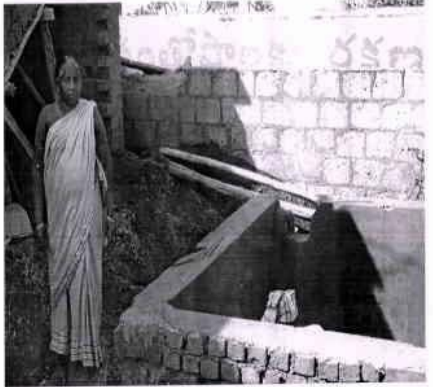
Toilets under construction after the ODF drive by mandal development office survey.