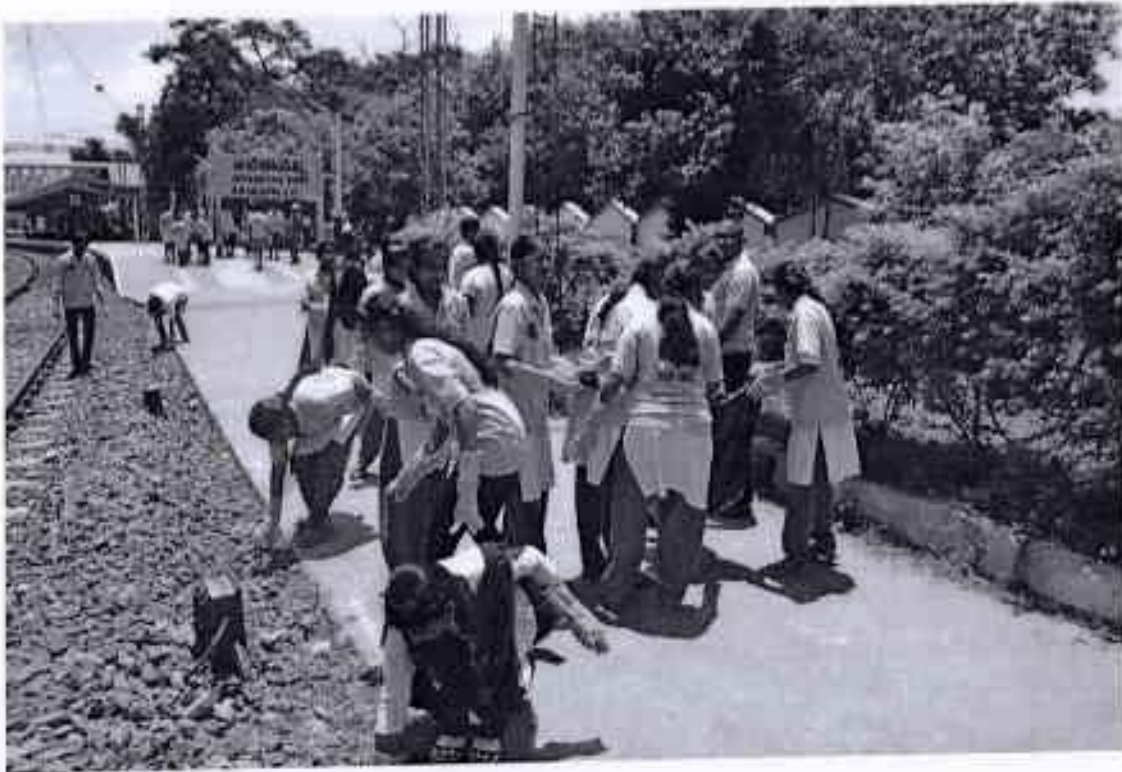
NSS Volunteers cleaning the premises of Railway Station