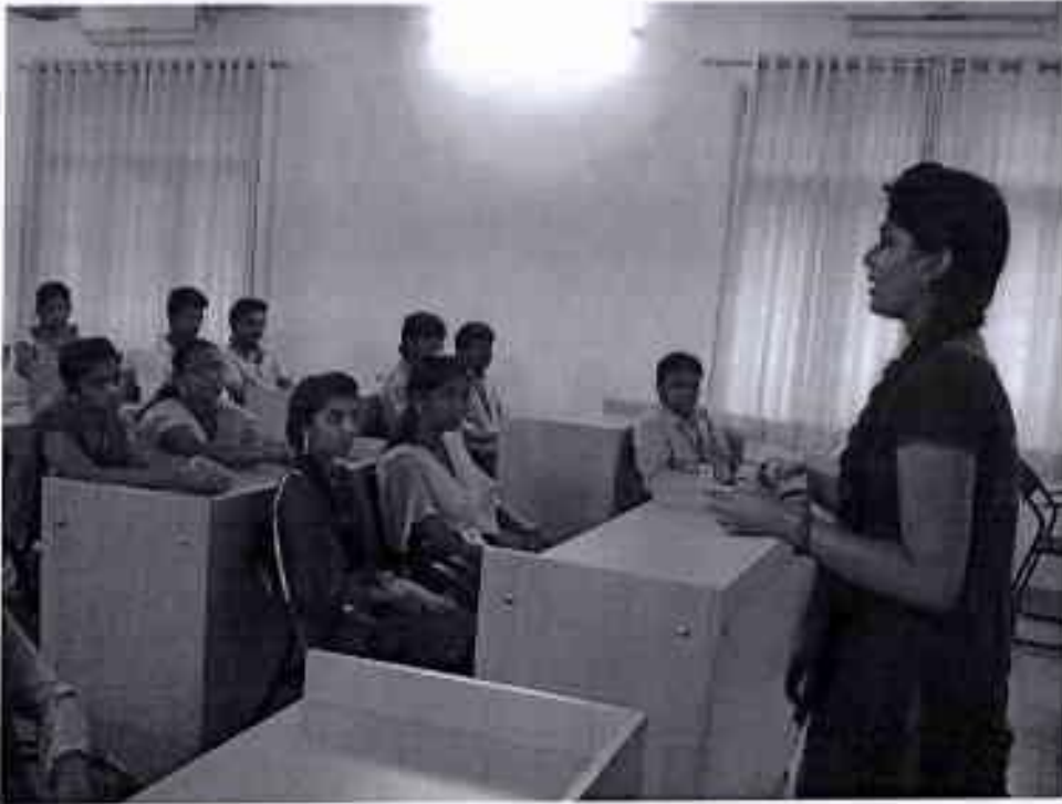
Students expressing their views on Hygiene and cleanliness in Elocution competition organized as part of Swachh Bharat Pakwada.