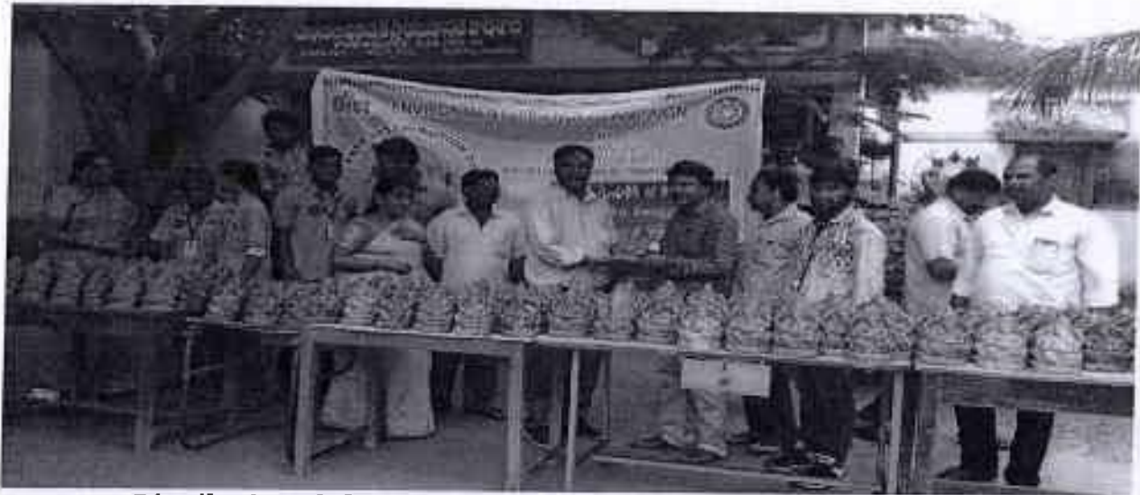
Distribution of Clay Ganesh idols at Maredupudi MP Primary school