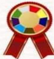
PADMASHRI R.M VASAGAM BOARD OF GOVERNOR