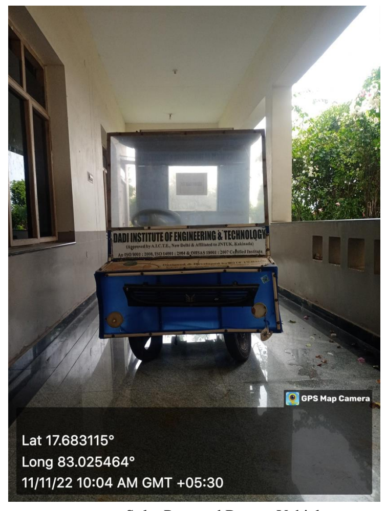
Solar Powered Battery Vehicle