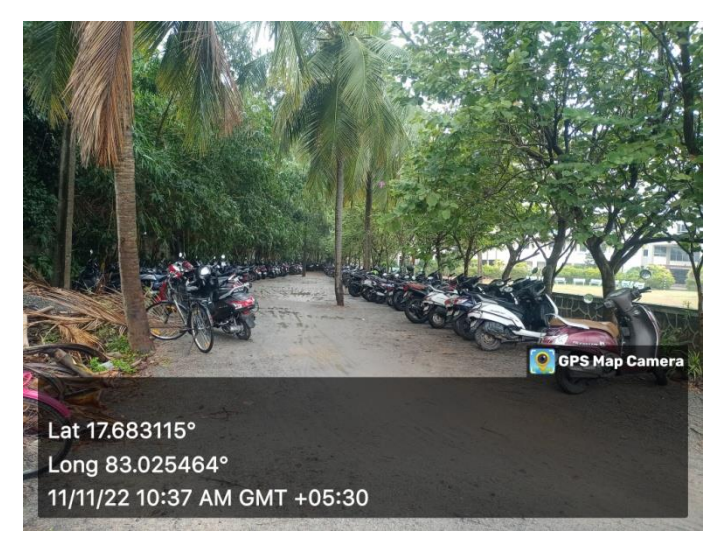
Restricted entry of automobiles

Unknown vehicles are not permitted inside the campus without prior permission. Visitors have to record their name, purpose of entry, in and out time and signature in the register maintained at the entry gates. Separate parking area is allotted for outsiders. CCTV cameras are also installed at the gates to monitor the entry and exit of the visitors. 'Clean Green Day' is observed once in every semester to create awareness on air pollution.