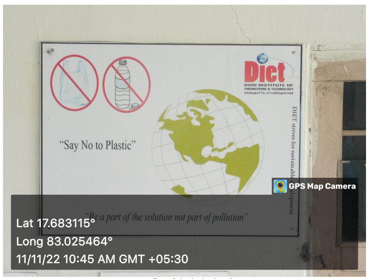
Ban of plastic sign boards