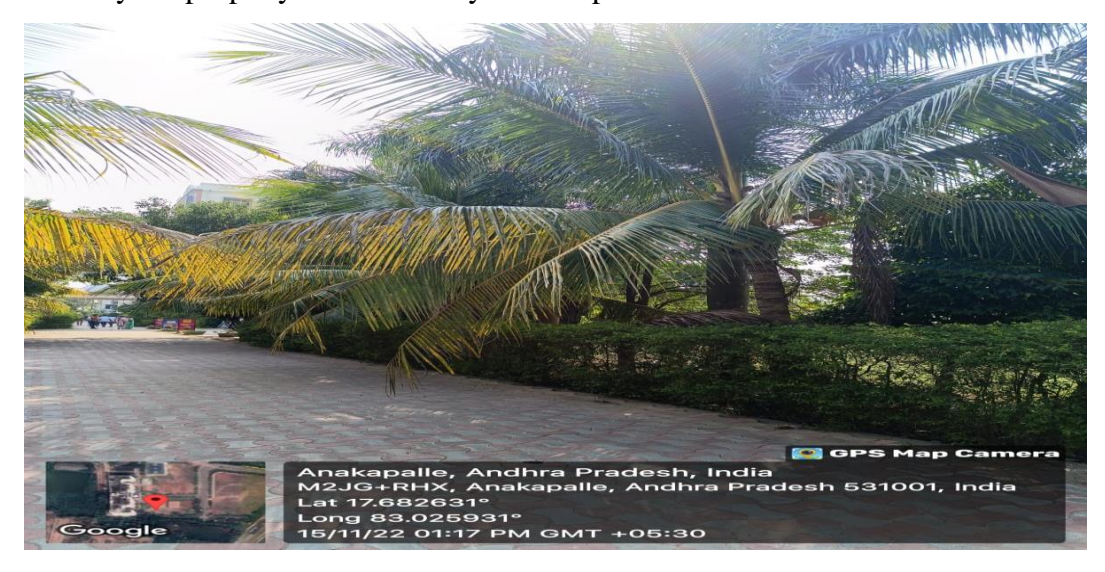
Pathways for Pedestrians

Vehicle parking space is provided at the main entrance of the institute campus. As the campus is vehicle free with some exceptions, students and staff experience comfort walking through the pedestrian friendly pathways. The internal roads are lined with trees and solar lights and they are properly maintained by the campus maintenance committee.