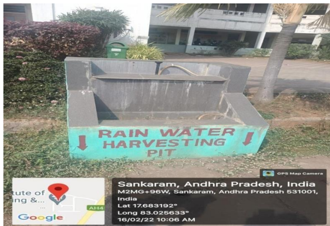
Rain water harvesting pit