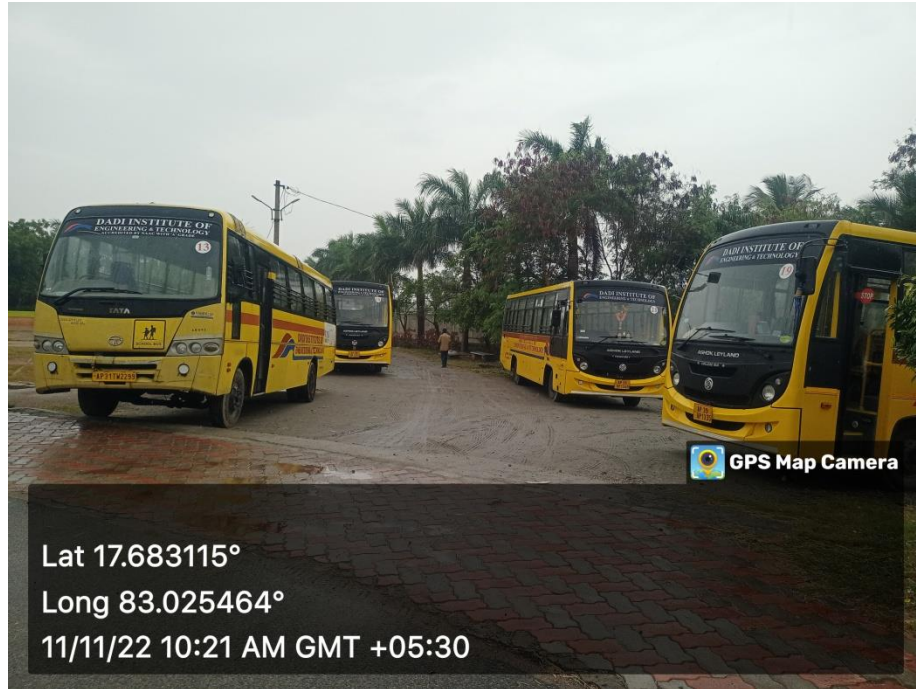
Ground Water Recharge Pit