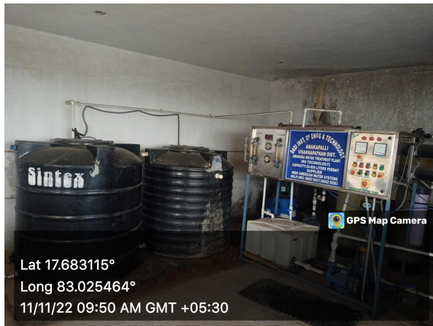
Water Treatment Facility

In this institute, the waste water has been purified by modern treatment technology using Filtration and Reverse Osmosis membrane. The plant having the purifying capacity of maximum 24000 liters a day. The raw water with an average total dissolved solid [TDS] of 750-1000 ppm is treated to reduce the TDS content to less than 100 ppm, which is generally acceptable upper limit of the TDS. In order to meet the requirements for all the people including students, staff and others is receiving a maximum of 2000 liters per day. Main process comprises of RO membrane filters held in parallel to each other and post treatment. The RO plant treated drinking water is dispensed through water filters throughout the institute which includes Class Room Blocks, Laboratory Blocks, Administrative Block, cafeteria and other locations in the campus. The waste water from the RO have been utilizing for gardening and washing purposes.