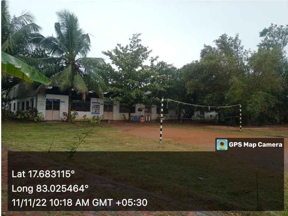
Waste water used for greenery