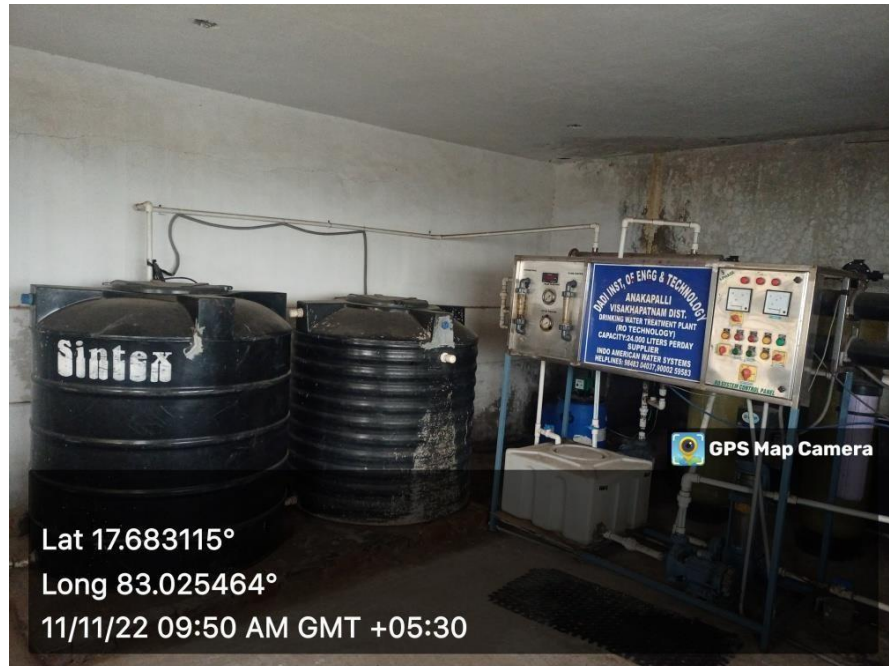
Water Treatment Facility