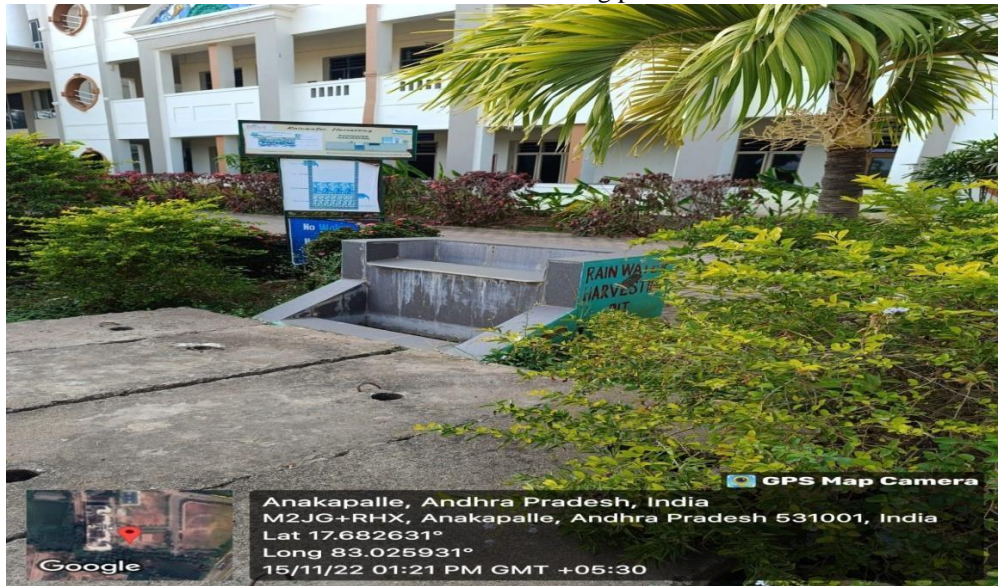
Rain water harvesting pit