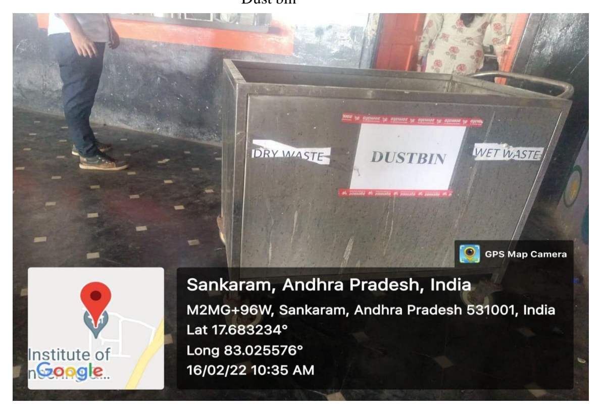
Canteen waste-Dry and wet waste