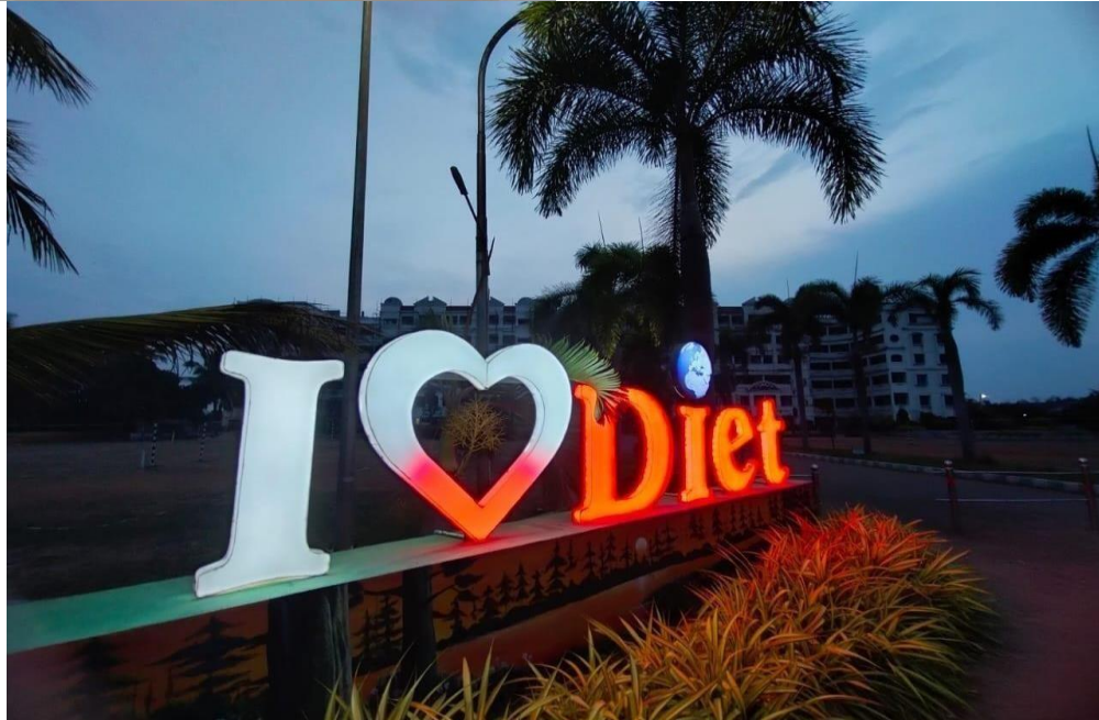
LED Lights in the campus