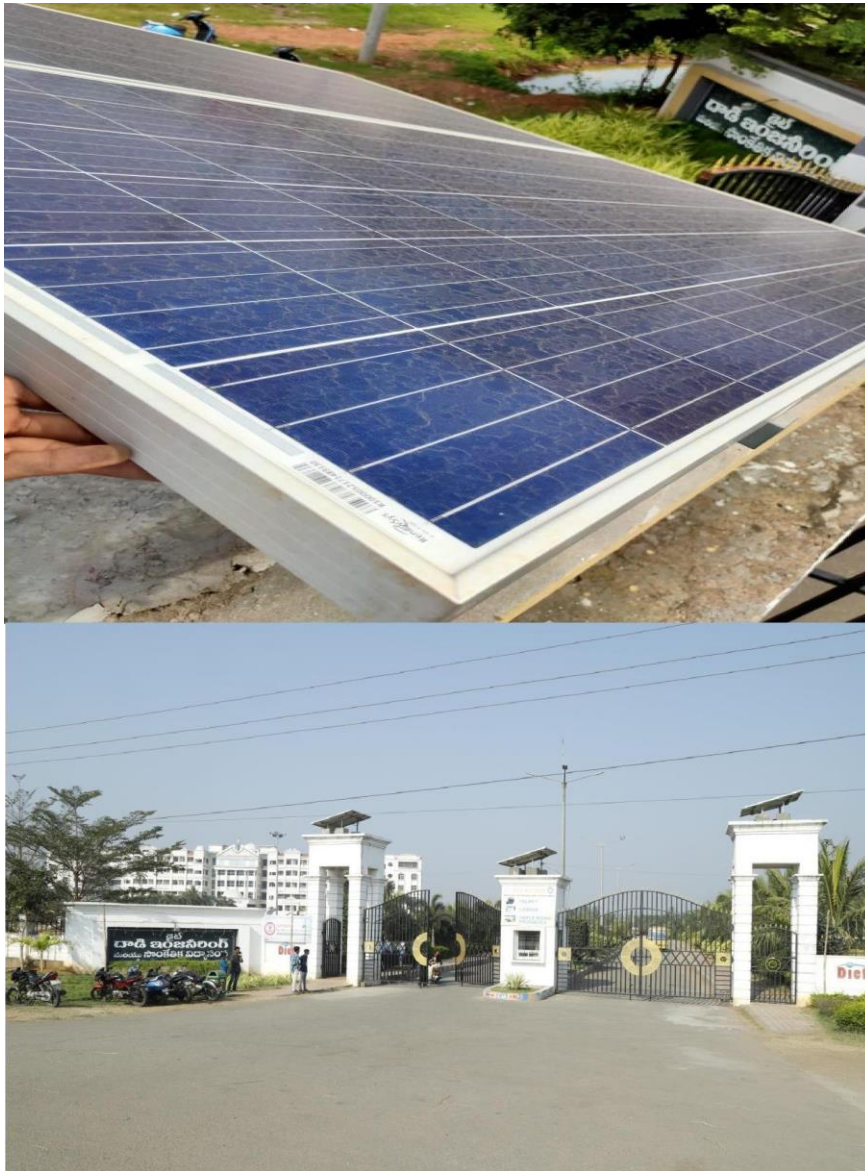
Solar Panels provided at the entrance of the Institution