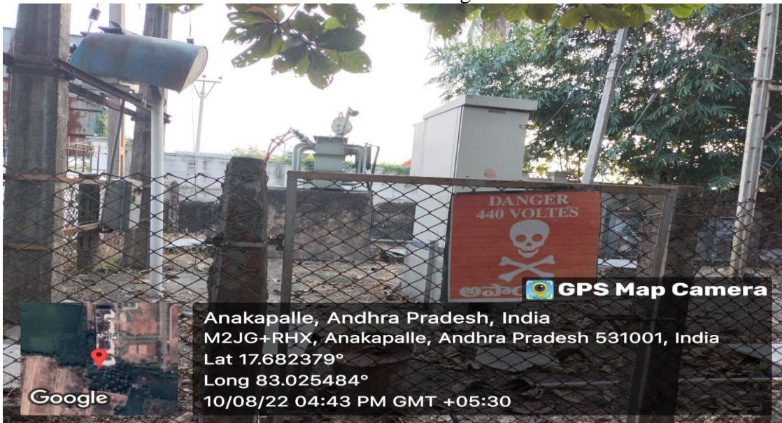
Transformer and Wheeling to the Grid at South-East portion of the Institution