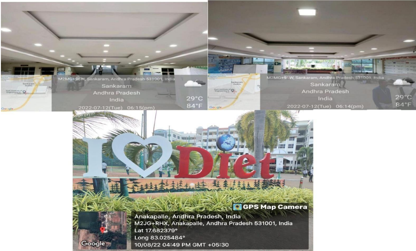
LED Lights in the campus