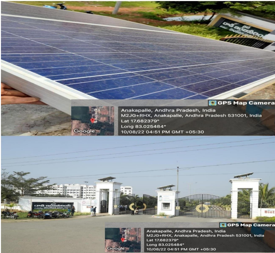
Solar Panels provided at the entrance of the Institution