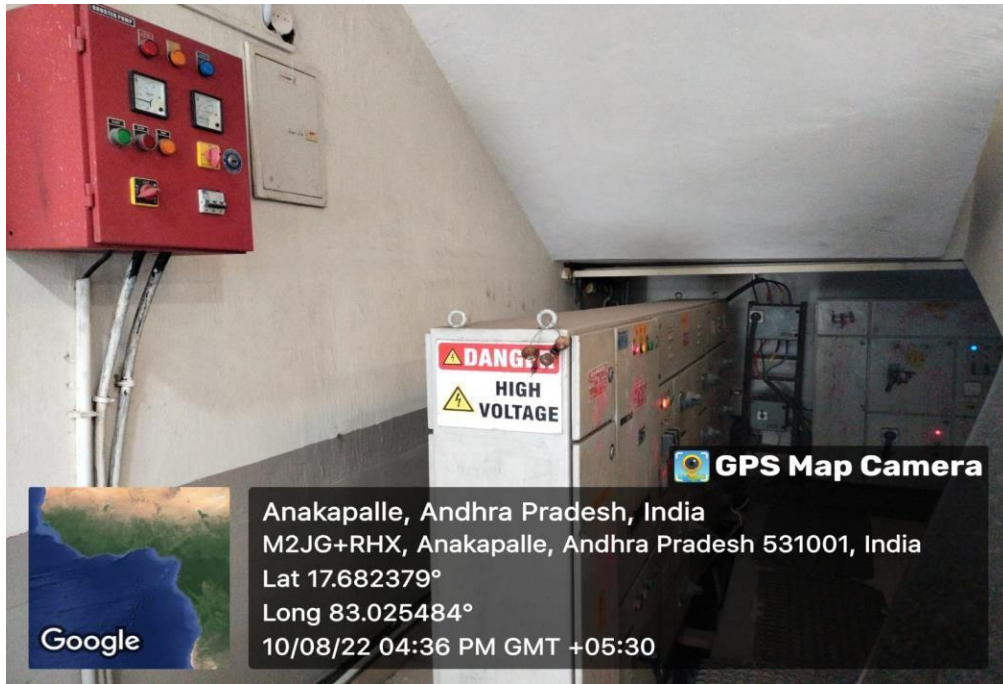
Devices installed for wheeling to the Grid