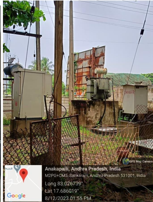
Devices installed for Wheeling to the Grid and Transformer at South-East portion of the Institution