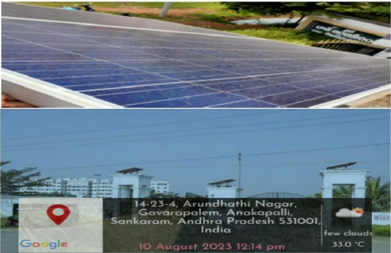
Solar Panels provided at the entrance of the Institution