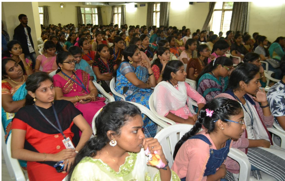
Fig 10: Faculty and student active participation