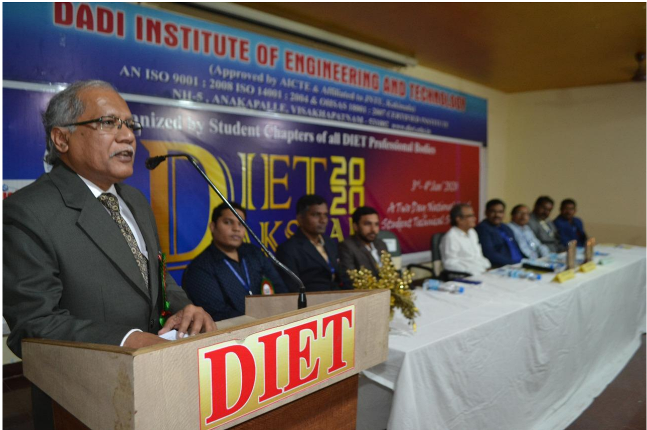
Fig 5: Guests Addressing the Gathering

Mobile: +91 9963981111, Website: www.diet.edu.in , E-mail: info@diet.edu.in