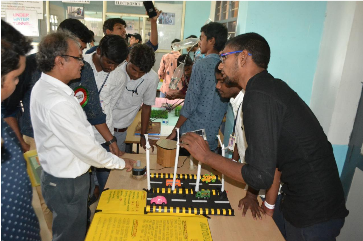
Fig 7:Media Coverage to the Event