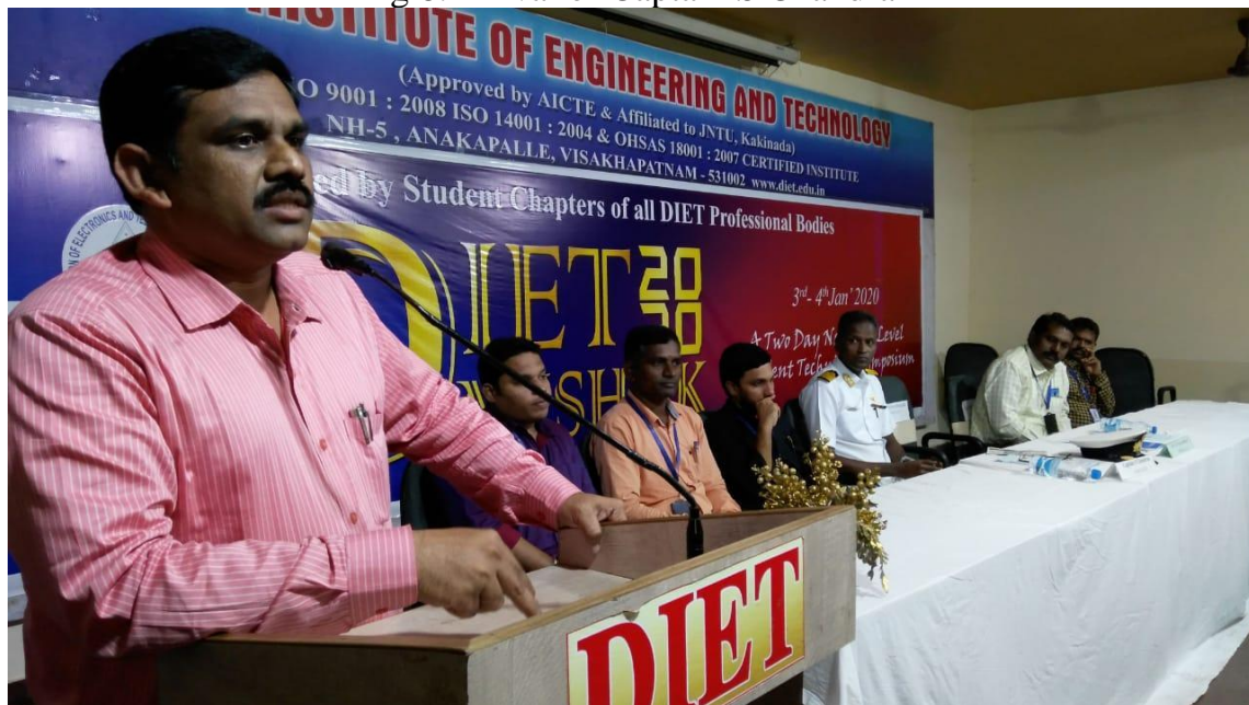
Fig 9: Principle speech