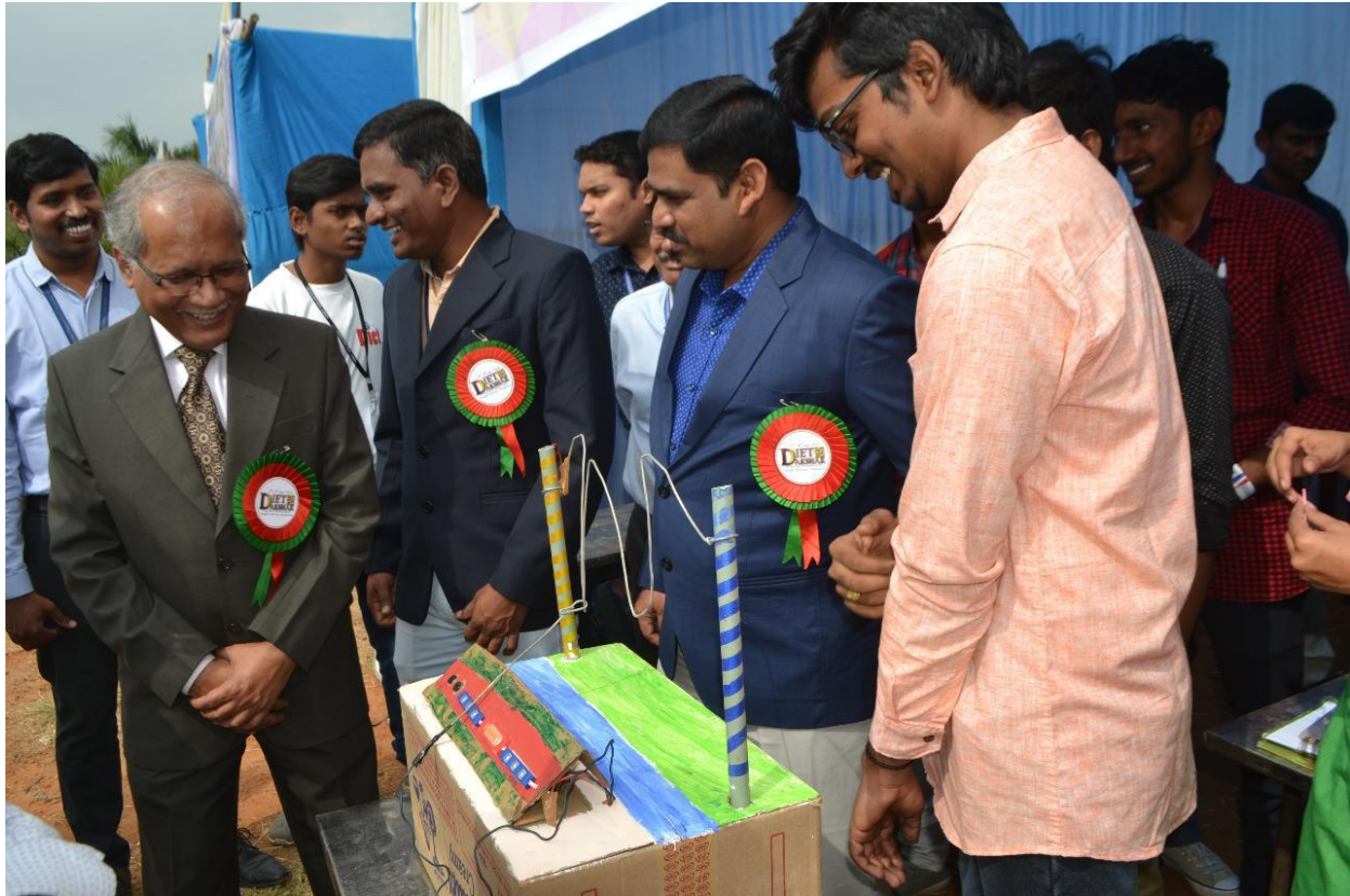
Fig 6: Guests Interacting with participants during Model Expo

Mobile: +91 9963981111, Website: www.diet.edu.in , E-mail: info@diet.edu.in