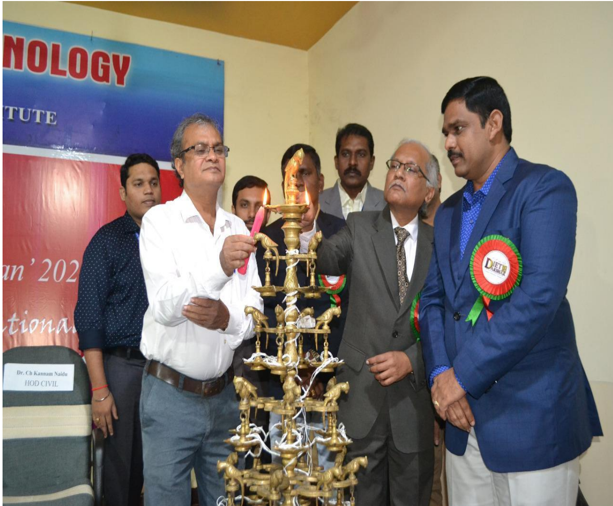
Fig 3: Lamp Lightening

Mobile: +91 9963981111, Website: www.diet.edu.in , E-mail: info@diet.edu.in