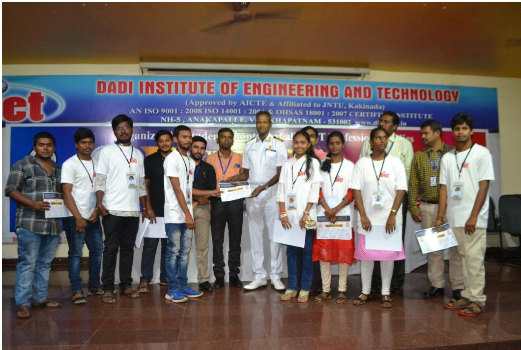
Fig 13: Prize Distribution

Mobile: +91 9963981111, Website: www.diet.edu.in , E-mail: info@diet.edu.in