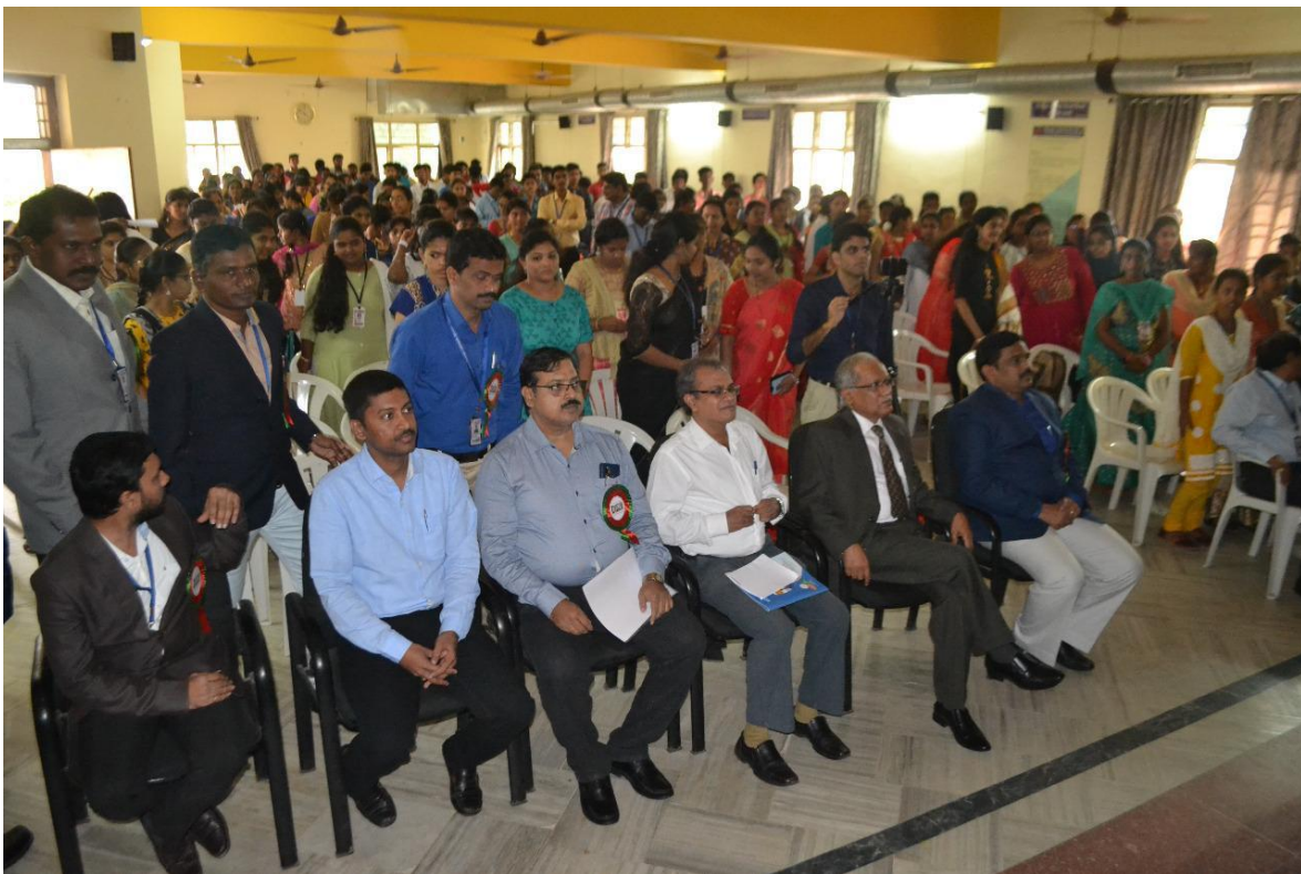
Fig 2: Inaugural Function & Lamp Lighting Ceremony

https://www.youtube.com/watch?v=jF9sseK-2Sk