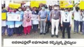
అసకాపర్లలో అవగాహన కల్పిస్తున్న వైద్యులు