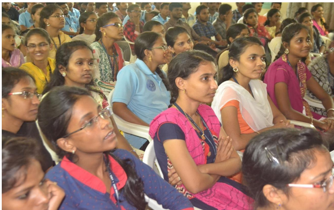
Figure: Student hearing to the lecture of the guest