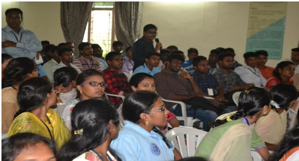
Figure: Students debating with the guests

Mobile: +91 9963981111, Website: www.diet.edu.in , E-mail: info@diet.edu.in