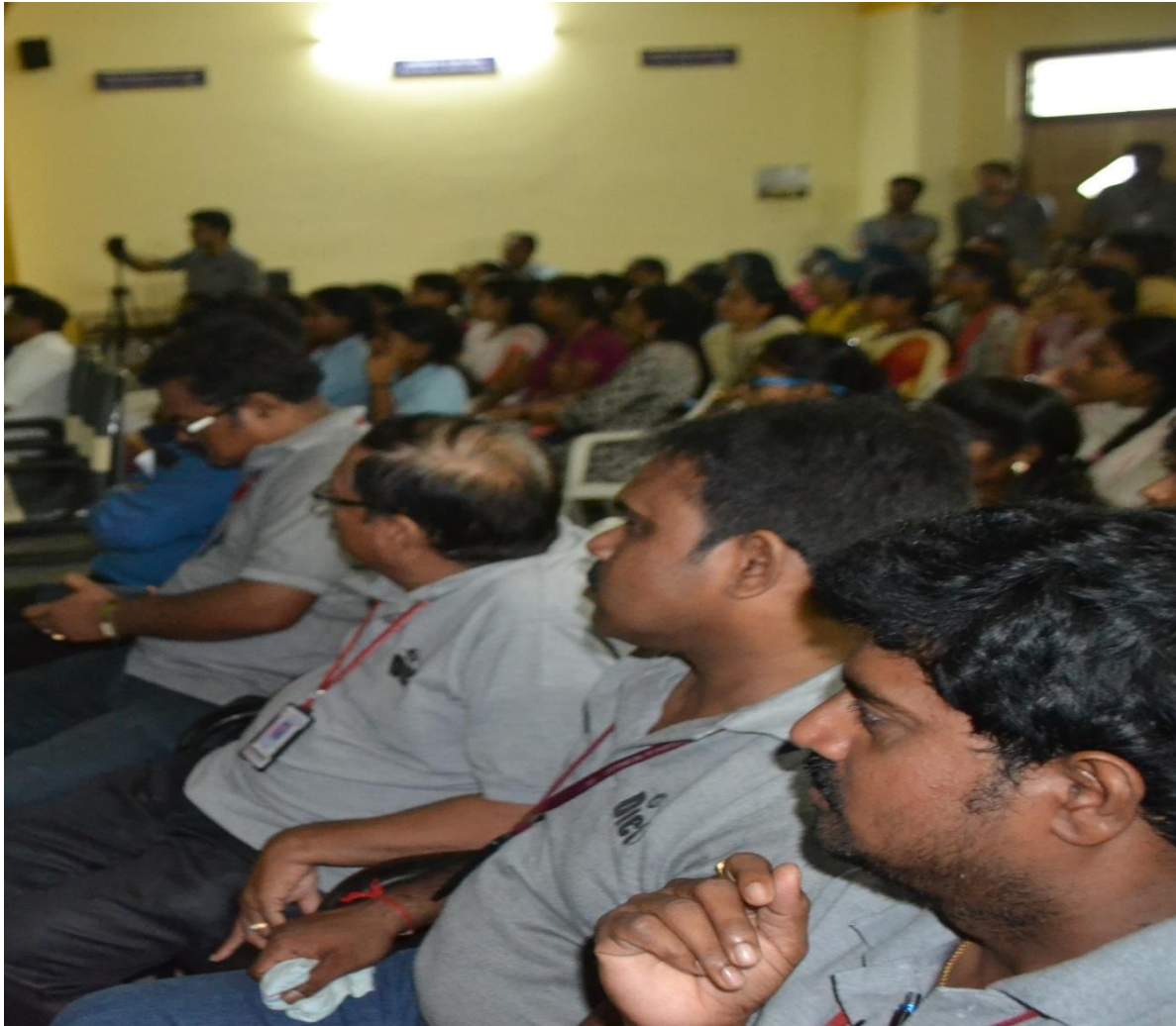
figure: on going program

Mobile: +91 9963981111, Website: www.diet.edu.in , E-mail: info@diet.edu.in