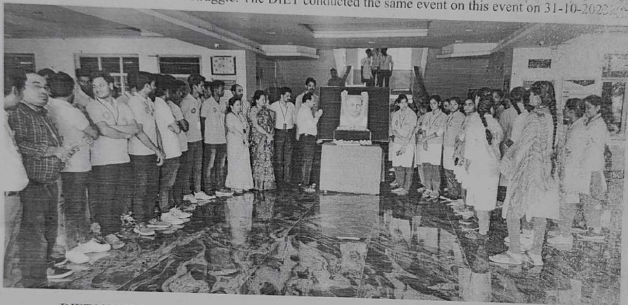
DIET NSS Unit celebrated National Unity Day on the eve of National Unity Day principal sir paying tributes to Sardar Vallabhbhai Patel

October 31 of every year is celebrated as National Unity Day in honor of Former Deputy Prime Minister of India SARDAR VALLABHAI PATEL, who was born on the same day in 1875. The day aims to acknowledge the efforts of Patel towards freedom struggle. The DIET conducted the same event on this event on 31-10-2023.