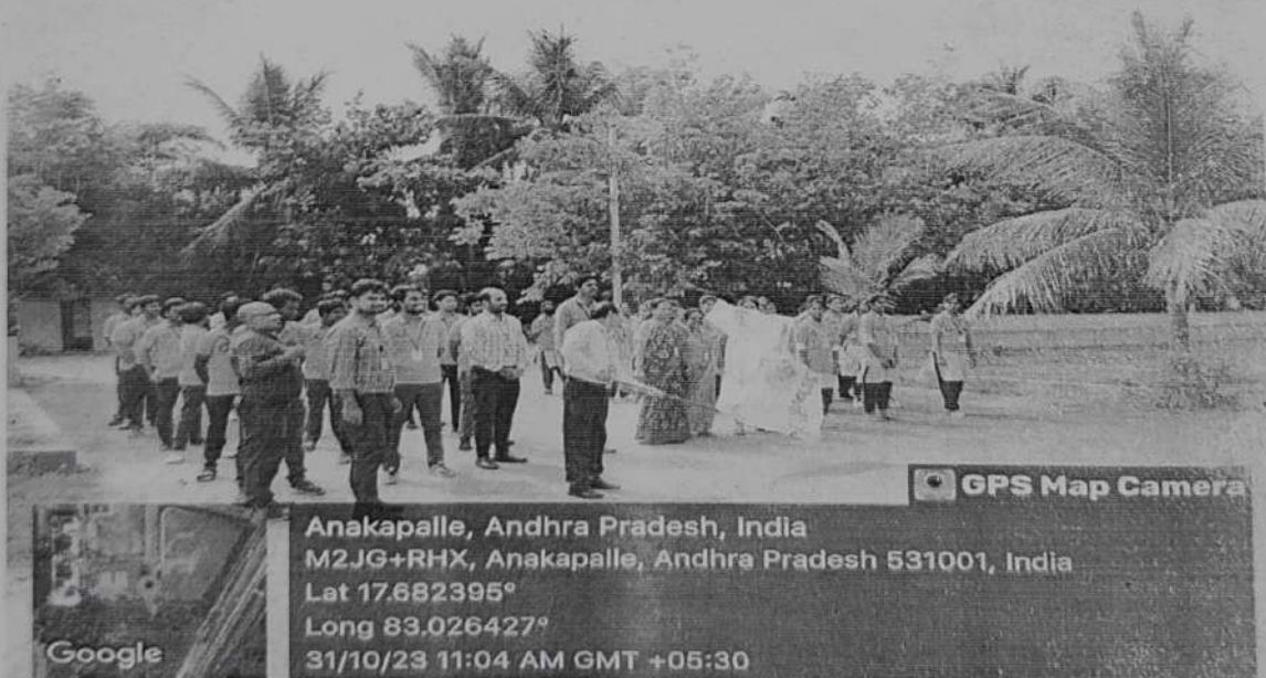
The National Unity Day running program was started by the principal, sir.