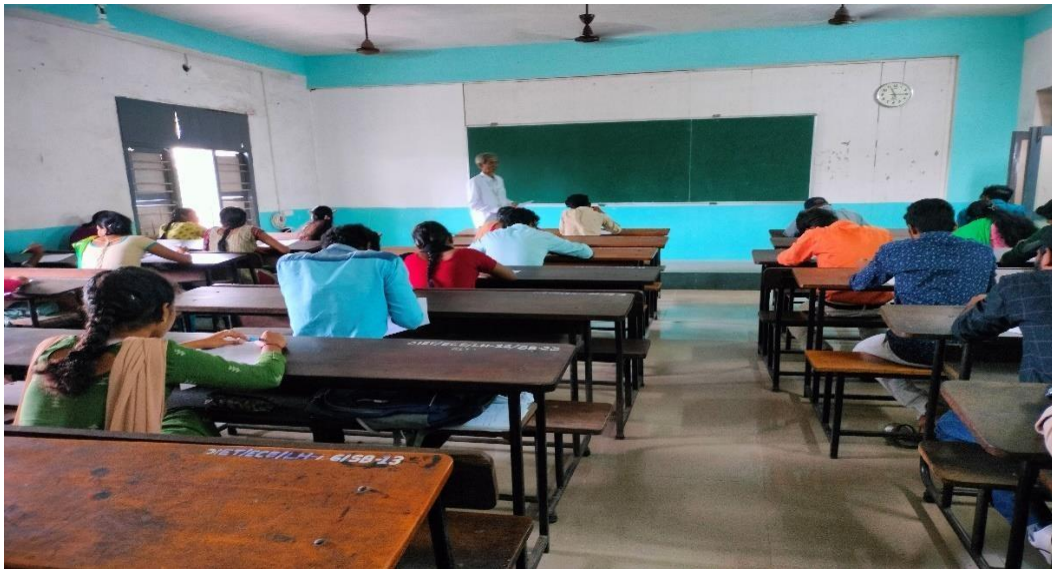
Campus Drive Assessment Test at DIET