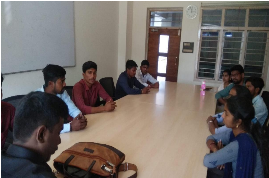
Group Discussions during Campus Drive