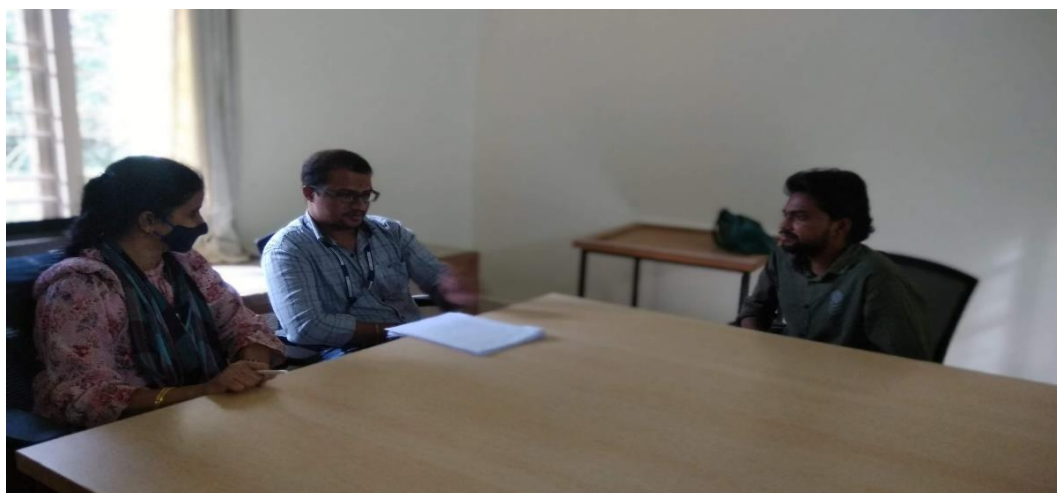
FACE to FACE Interview