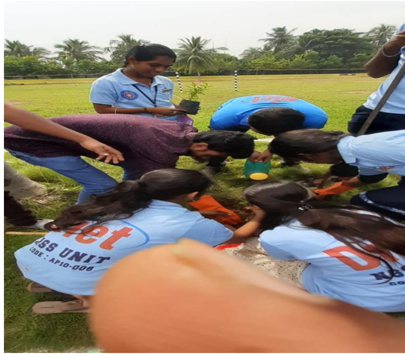
Figure: NSS Student Volunteers participating plantation