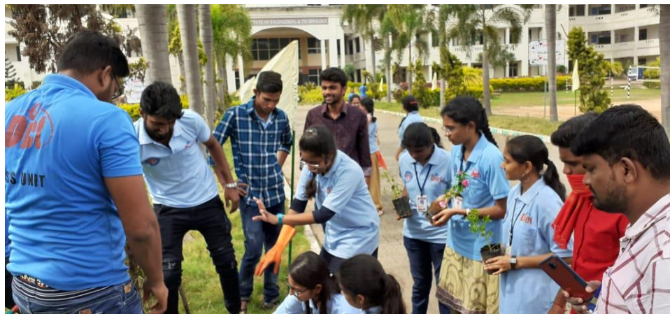
Figure: NSS Student Volunteers participating plantation

This initiative needs the support of our young dynamic students and teachers. As a responsibility towards the Mother Nature and contribution to this initiative. Either Students or suitable person from the institute should look after this, planted trees for initial 1 to 2 years. Also, these trees should have suitable utility in the nearby area. Each Student should plant at least 1 tree.