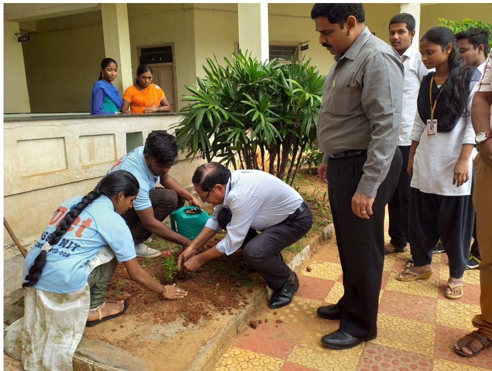
Figure: vice Principal garu plantation