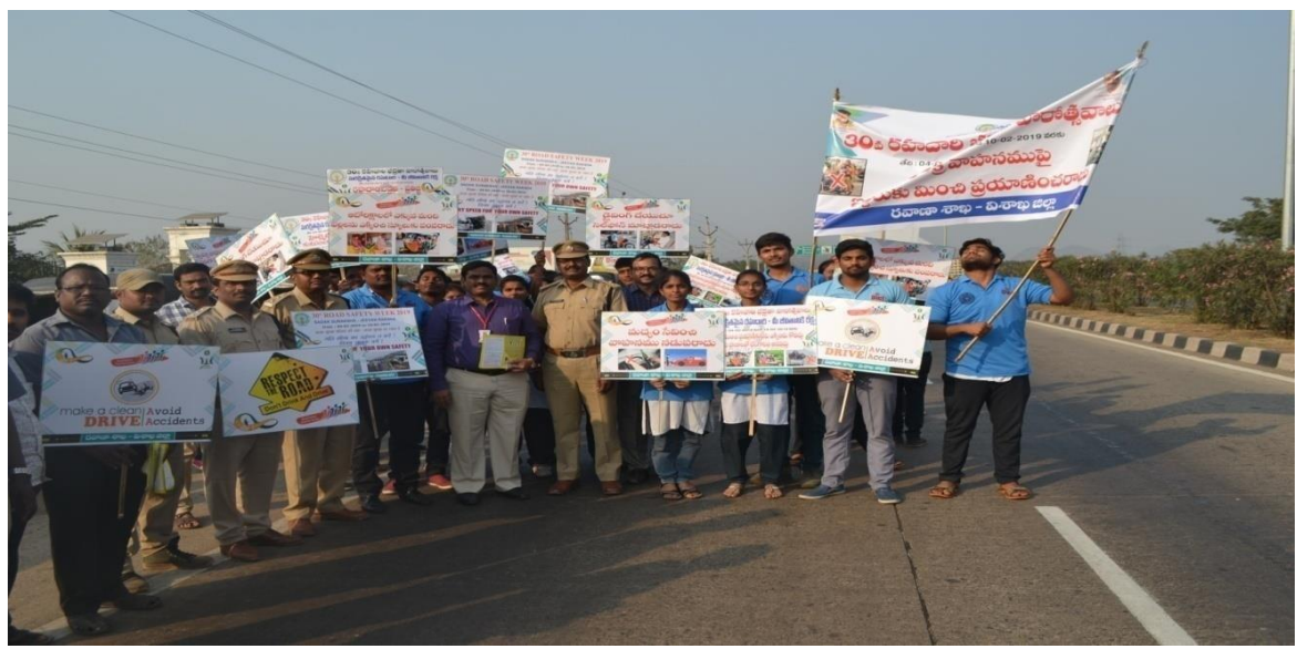
Figure: Creating Road safety awareness by NSS student volunteers