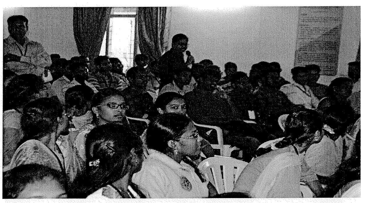
Figure:Students debating with the guests

Mobile: +91 9963981111, Website: www.diet.edu.in, E-mail: info@diet.edu.in