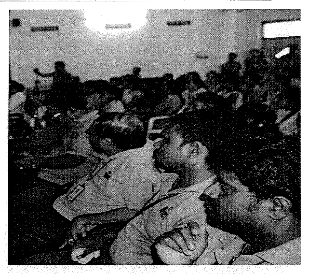
figure: on going program

Mobile: +91 9963981111, Website: www.diet.edu.in, E-mail: info@diet.edu.in