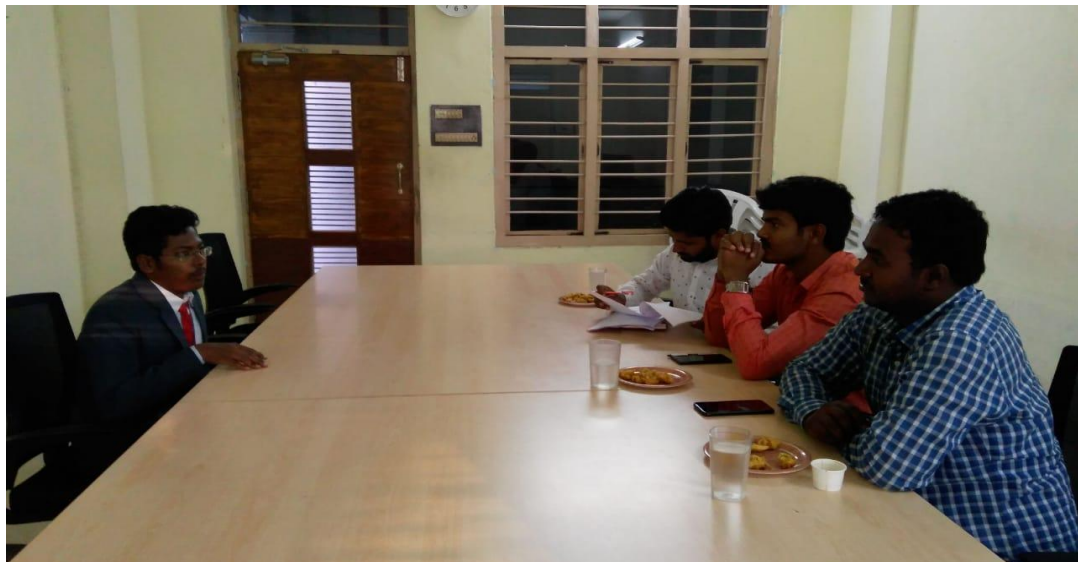
Fig 2 Conducting Interviews

domestic and industrial purposes. There are many layers to our successful Dewatering Project. When setting a developing platform, several factors are taken into account, and one of the most successful strategies provides efficient groundwater control prior to its positioning. In the construction sector this process is termed as Dewatering