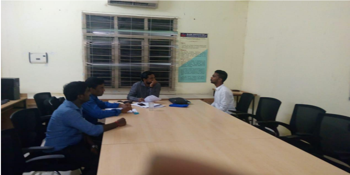
Fig 3: HR Round