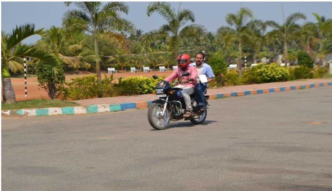
fig1: Driving test conducted by NSS students at Anakapalle

NSS volunteers made this drive successful.