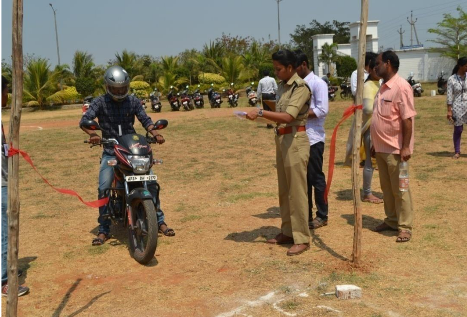
fig4: driving test conducted by NSS students at Anakapalle