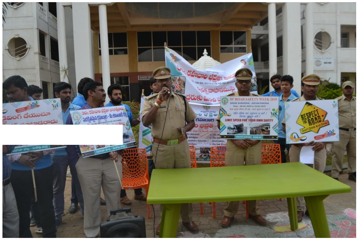
fig: student volunteers rally on awareness on road safety

NSS Unit at DIET conducted Road safety awareness on 20-8-2019. Road safety campaigns are an important way to spread awareness among people about road safety measures and rules. The results of road safety campaigns depend on the manner of communication to road users. 176 students along with NSS Unit participated in the event. Many issues about road measures, wearing of Helmet, no triple riding, wearing of seat belt etc; were been made aware to the by passers.