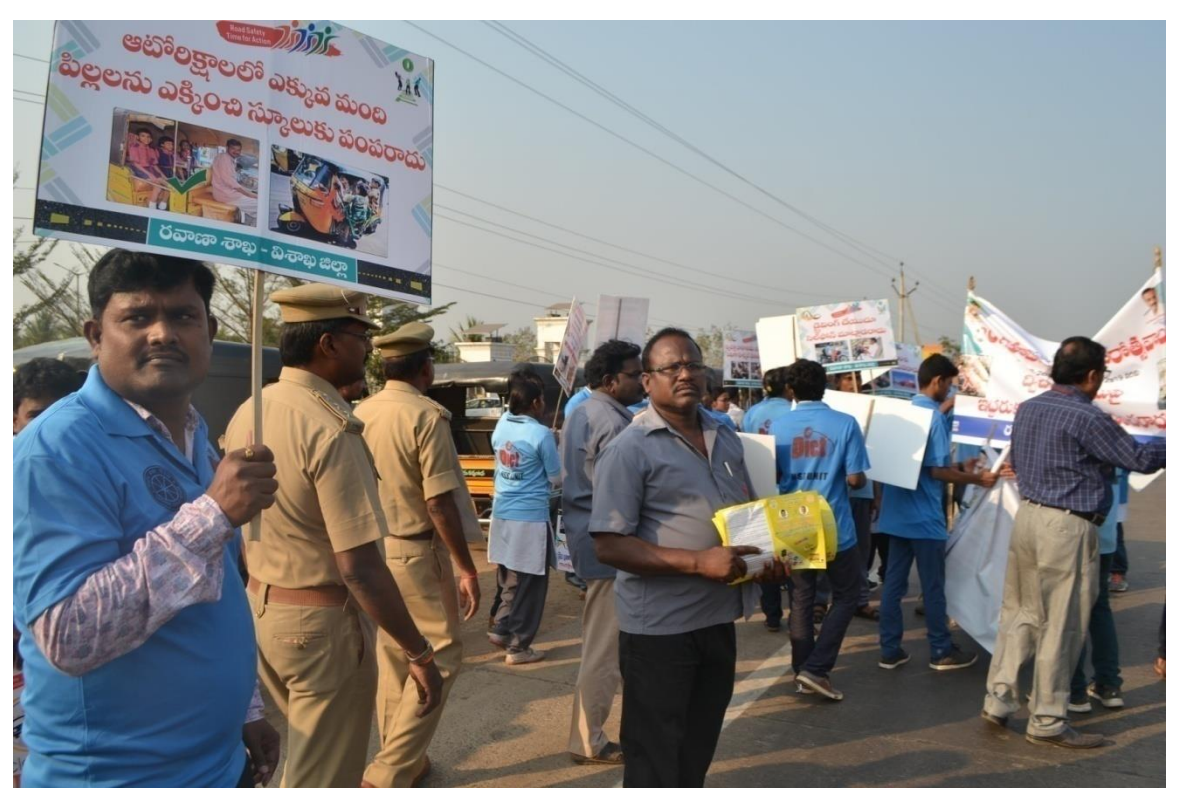
fig: Student volunteers participating the road Safety awareness