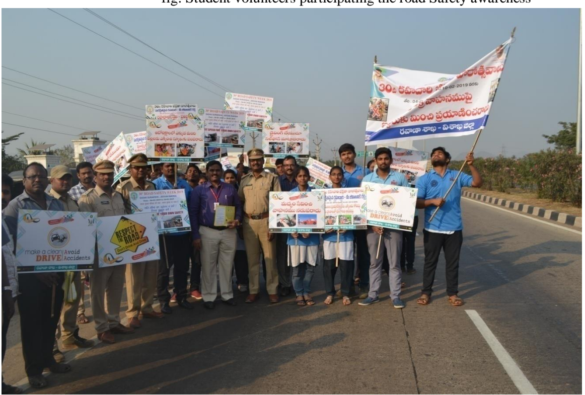
fig: Student volunteers participating the road Safety awareness