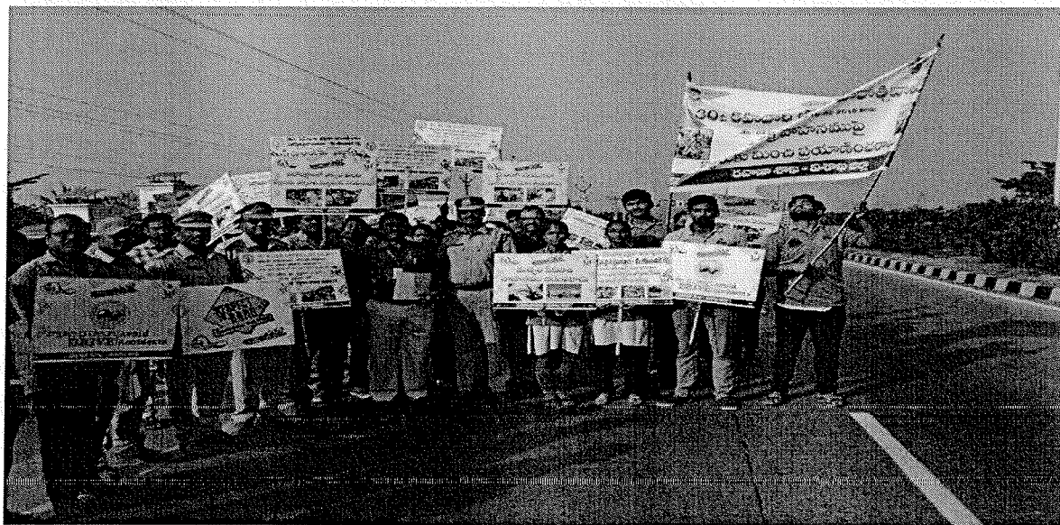
Figure : Creating Road safety awareness by NSS student volunteers

[Signature] Programme Officer National Service Scheme (Unit No. AP 16-108) Dadi Institute of Engg & Technology Anakapalle - 531 002