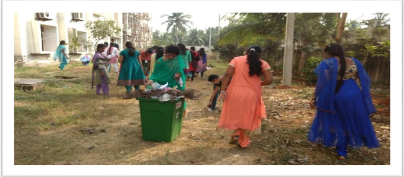
figure :Girl Students involvement in the Campingn